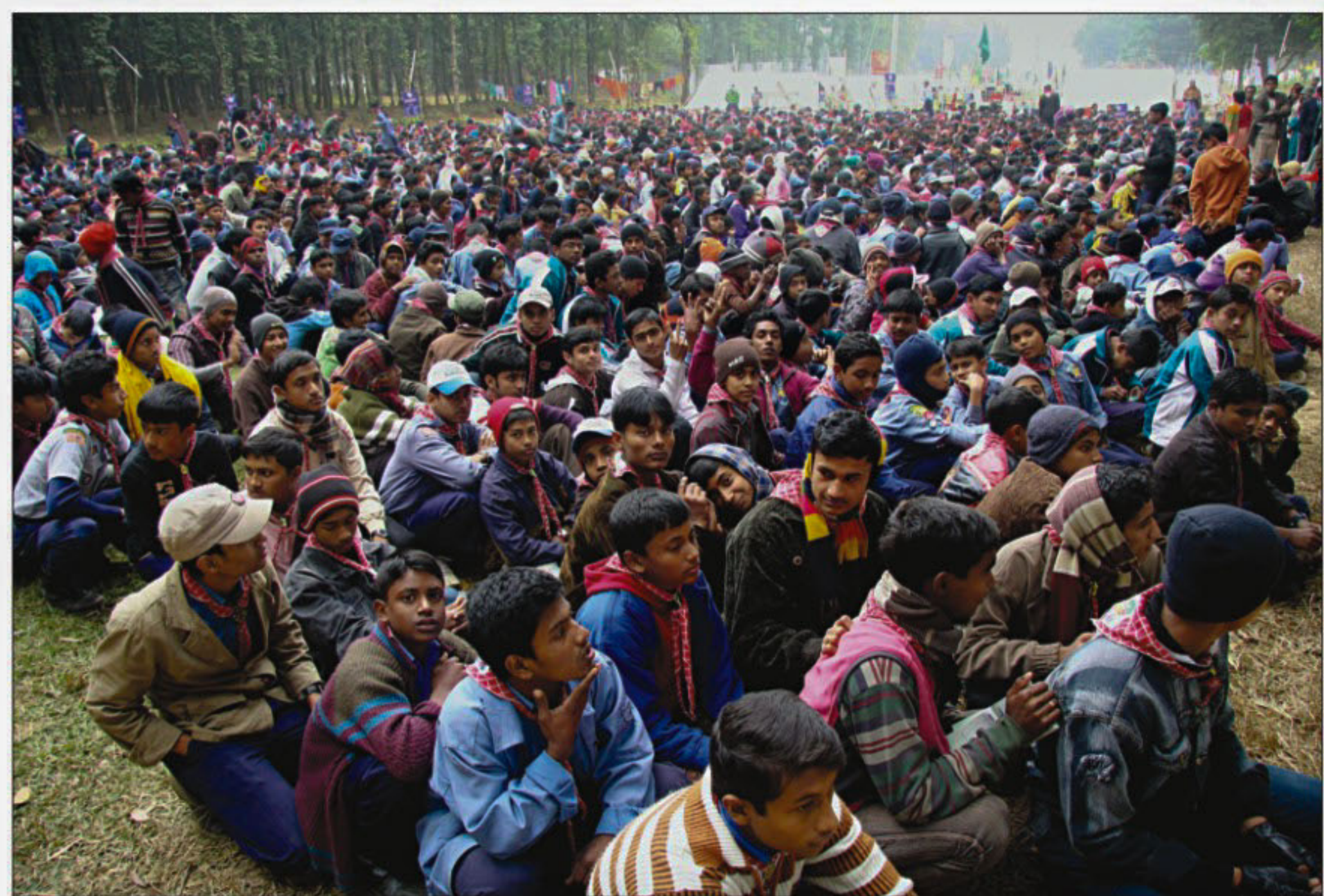
Scouts attend a programme at their 8th National Jamboree in Gazipur yesterday. About 13,000 boy and girl scouts from across the country and abroad are participating in it.