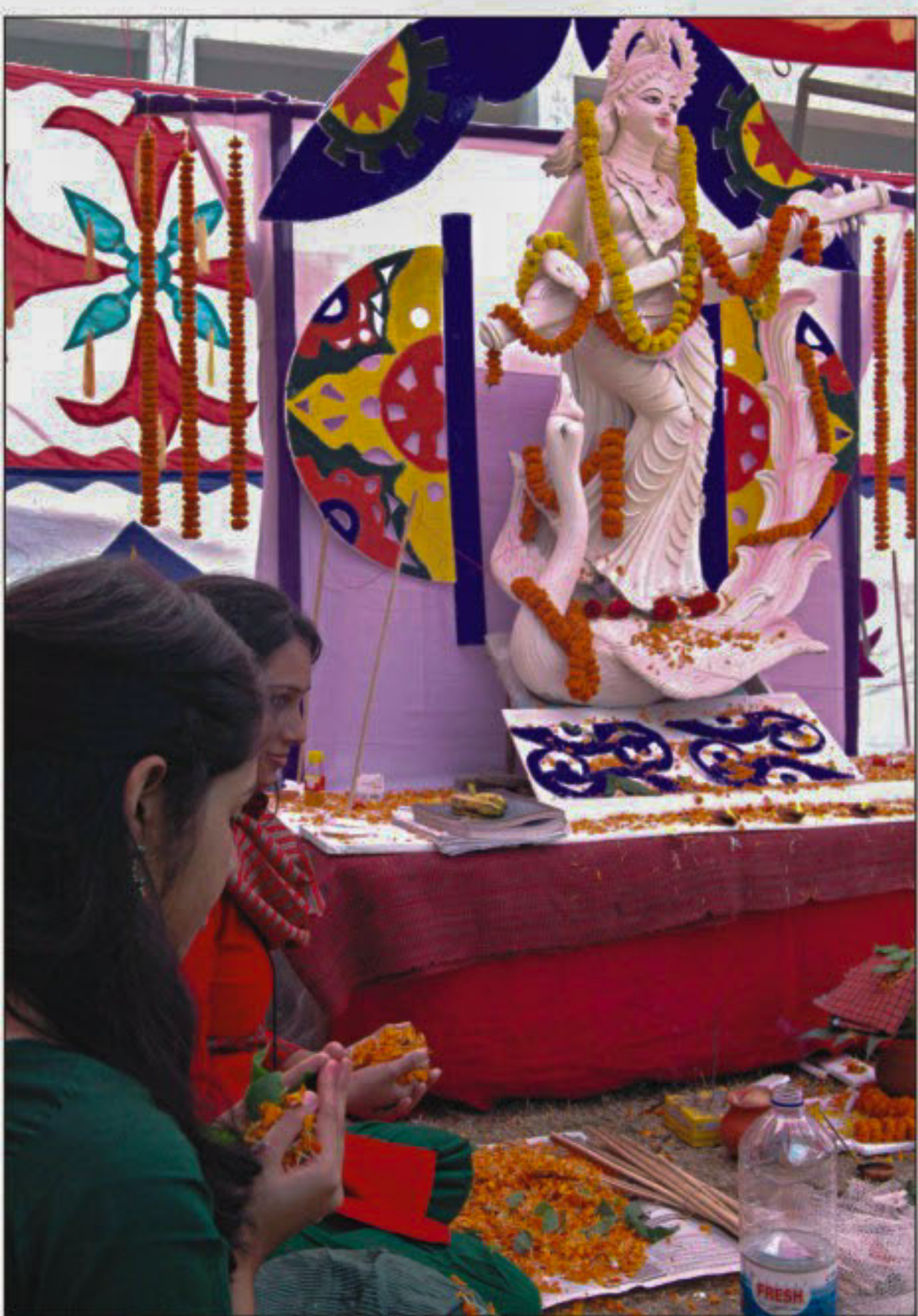
Hindu devotees offer prayers during Saraswati puja on Jagannath Hall premises on the Dhaka University campus yesterday. Saraswati is the goddess of knowledge.