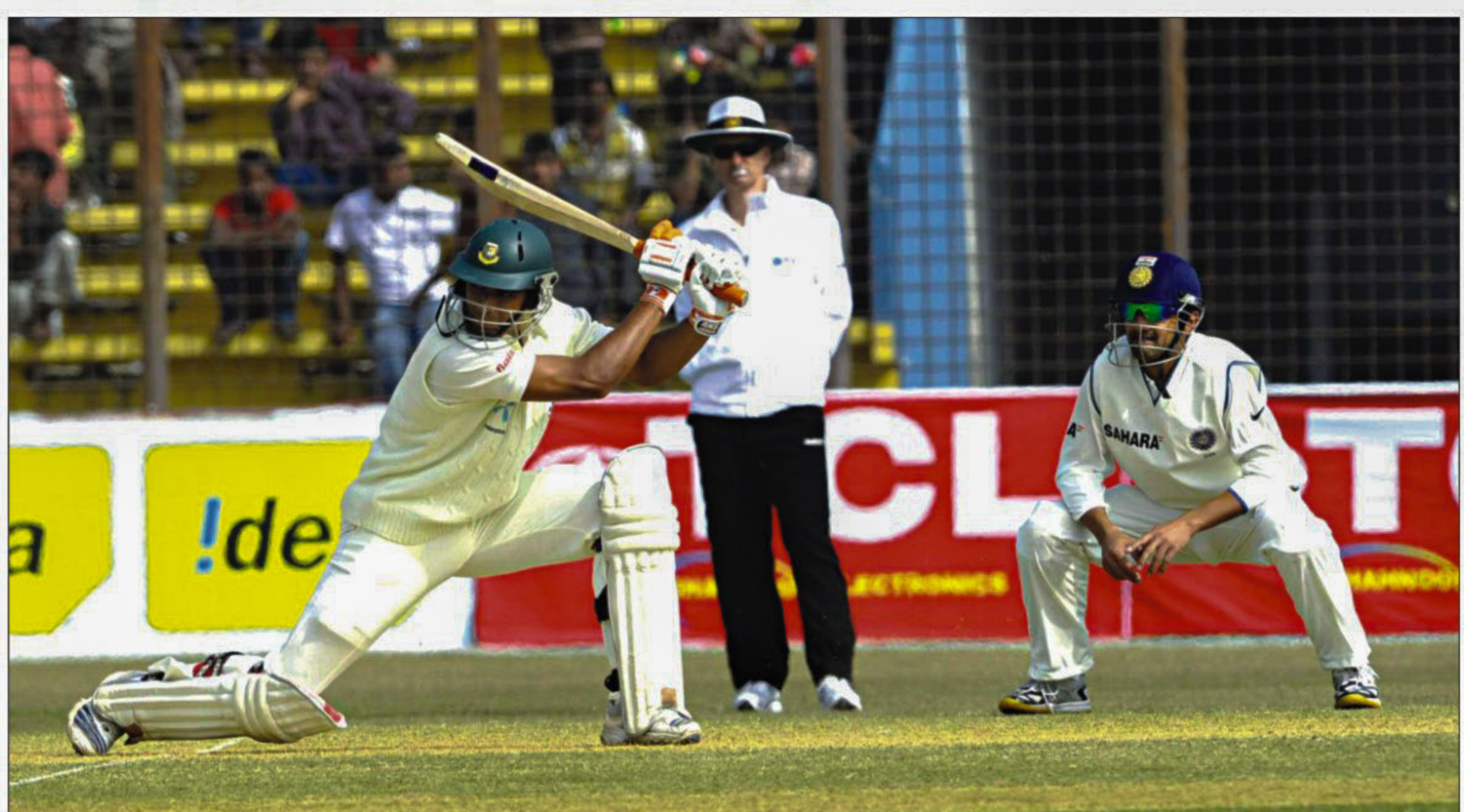
A kneeling Mahmudullah Riyad follows through on a front foot cover drive during his crucial knock of 69 on the third day of the first Test against India at Zahur Ahmed Chowdhury Stadium in Chittagong yesterday.