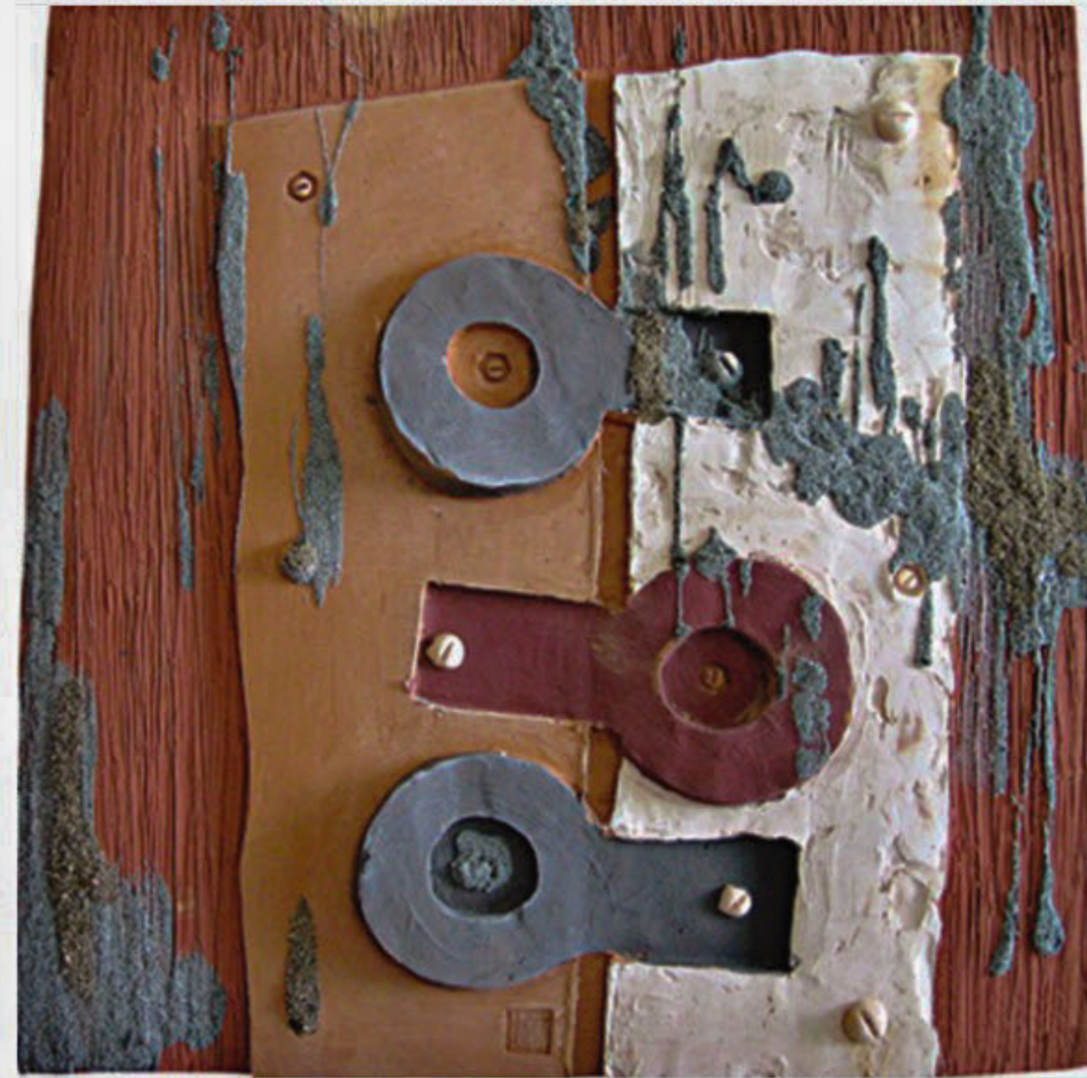
A four-day solo ceramic exhibition of artist Mohammad Rezaur Rahman's work ends today at the Drik Gallery. Titled "Transformation of the Object", the exhibition was inaugurated on January 17. This is the second solo exhibition by the artist. The exhibition features stoneware pottery (popular in China) and earthenware terracotta (widely used in Bangladesh). The exhibition is open to all from 3pm to 8pm.