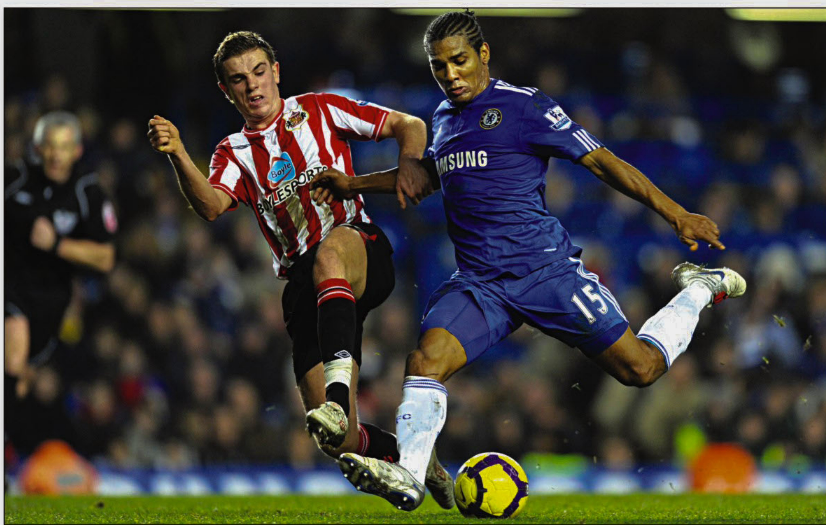
Chelsea winger Florent Malouda (R) prepares to shoot under pressure from Sunderland defender Jordan Henderson during their English Premier League encounter at Stamford Bridge on Saturday.