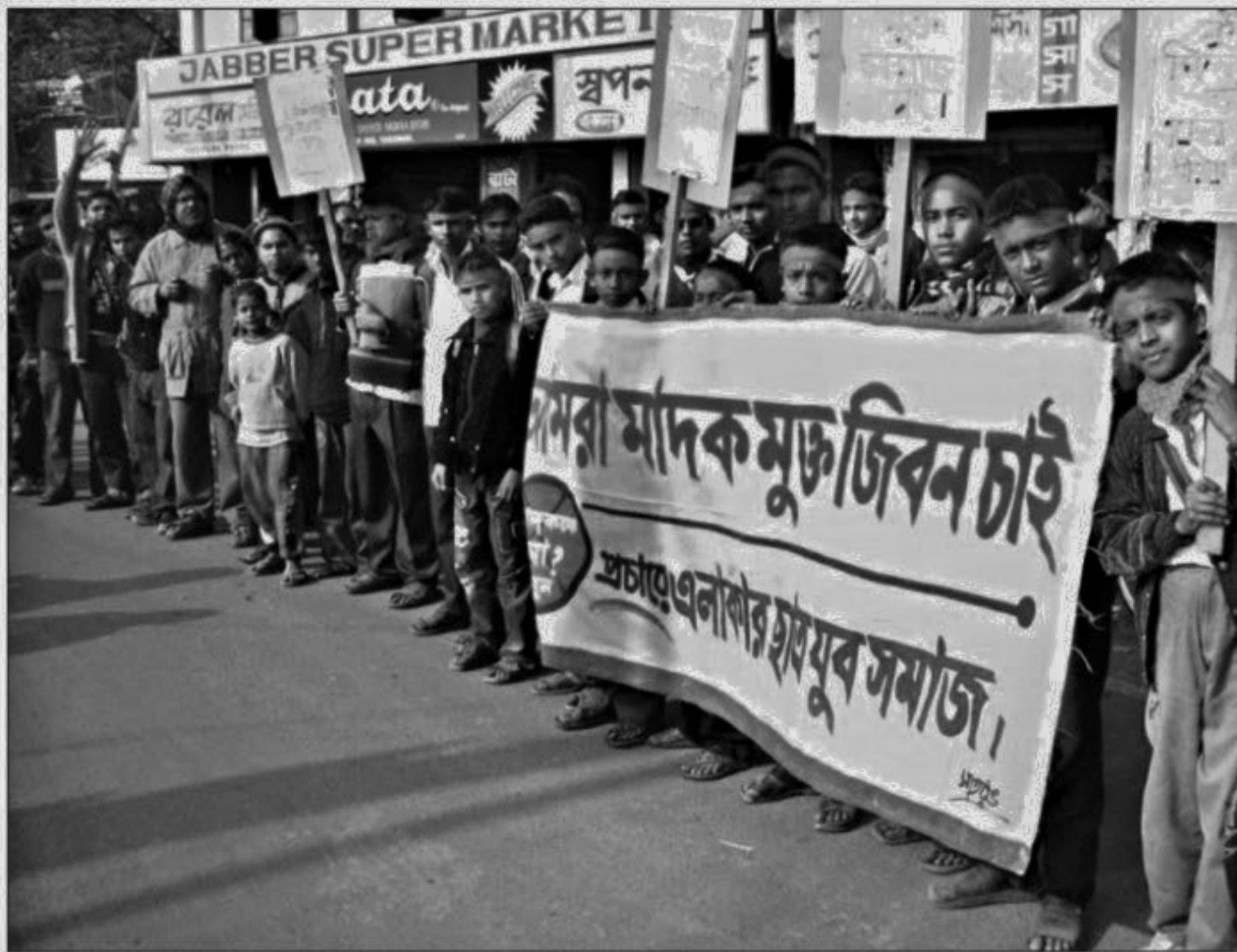
A large number of people including students join a human chain in Thakurgaon town yesterday demanding immediate steps to stop drug trade in the area. Local youths under the banner of Chhatra-Jubo Samaj organised the human chain and held a rally to create awareness against evils of drugs that threaten the locals, especially the young generation.