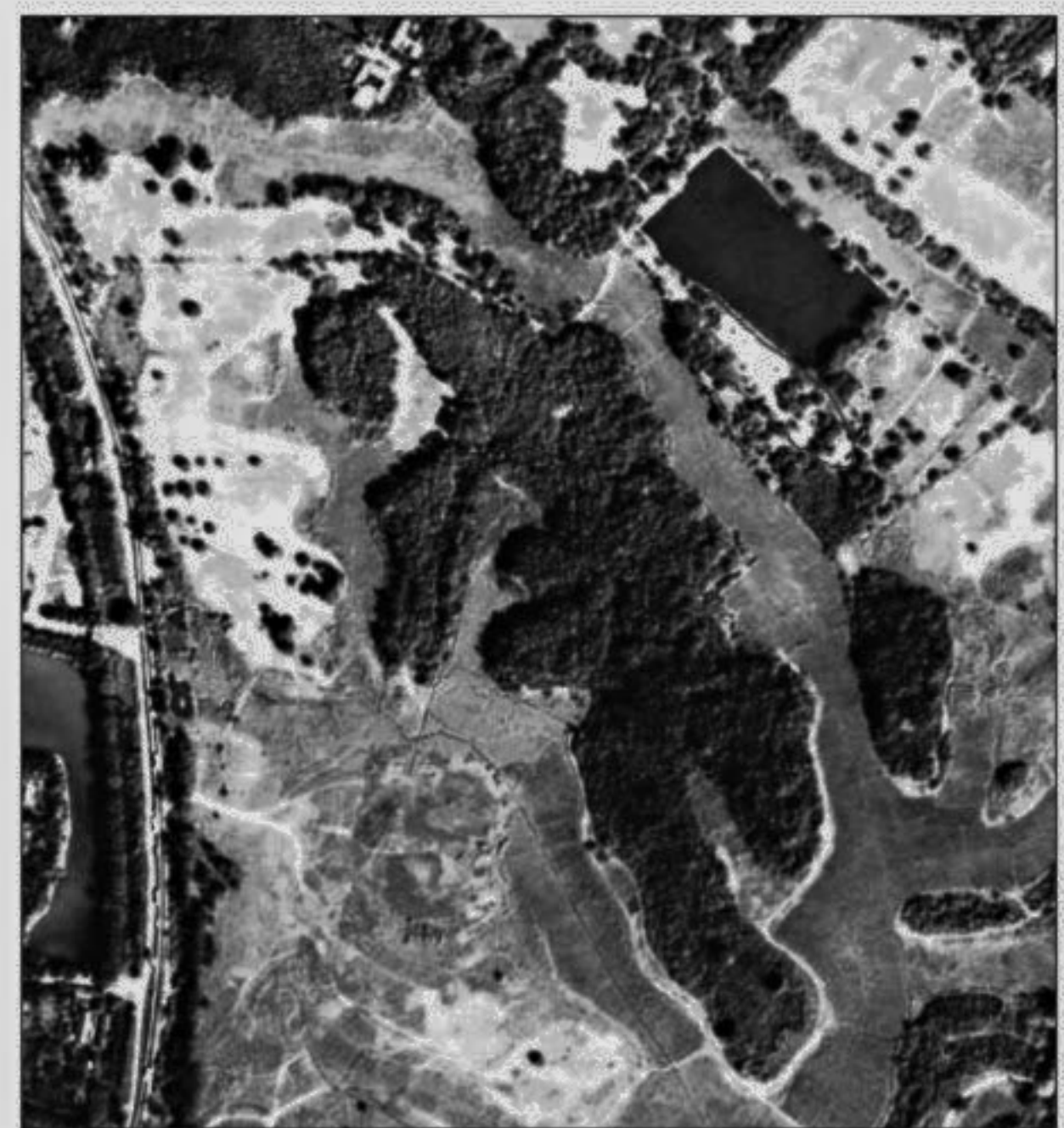
Aerial view of 'Aranyalaya.'

KEEPING animals in zoo for public recreation is an old concept. In a few past centuries many zoos have been established around the world as refuge for the captured wild animals mainly for giving people pleasure. Even today the zoos are not discarded in the face of movements by animal rights groups. Rather, some new zoos are being set up with a view to promoting care of people for the wild animals, reproduction of endangered species and scope of research on wild animals.