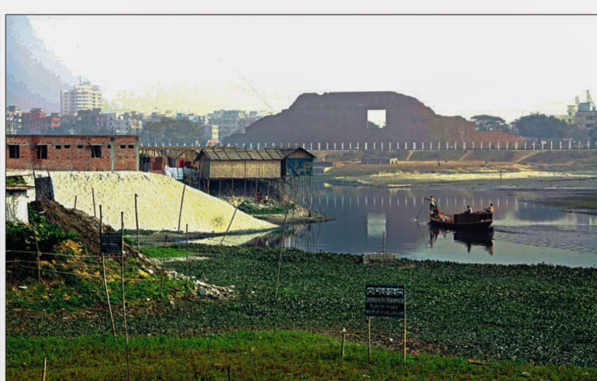
The photo taken at Rayerbazar yesterday shows the age-old Haikkar Khal being filled up as a real estate company has been pumping sand on the west side of the Martyred Intellectuals' Monument.