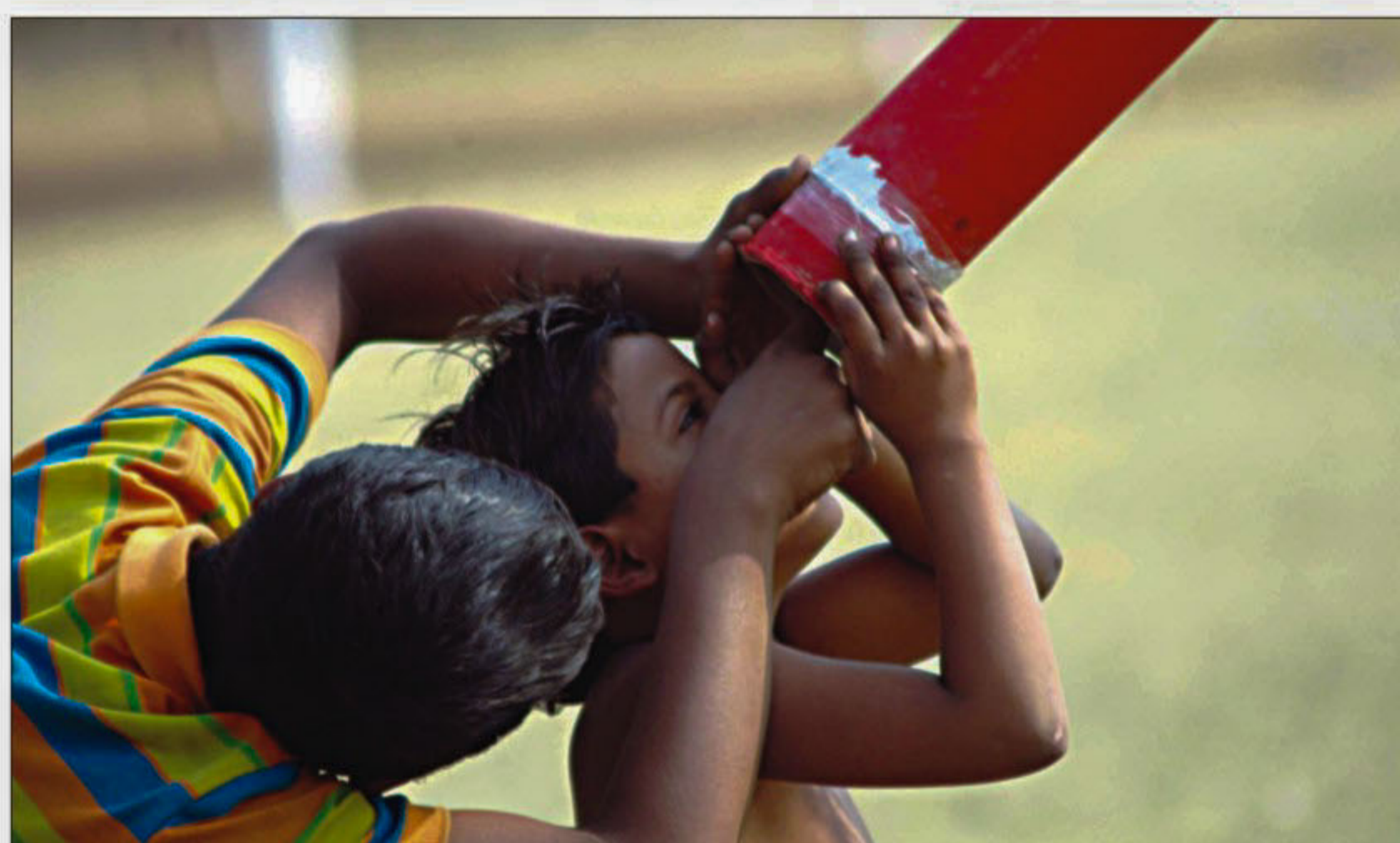
An urchin tries to have a glimpse of the first annular solar eclipse of the year while another assists him at an eclipse observing camp on DU campus yesterday. The eclipse was seen from Dhaka between 12:44:07pm and 4:58pm. An AFP photo sequence, above, shows the moon obstructing the view of the sun in Colombo, Sri Lanka yesterday.