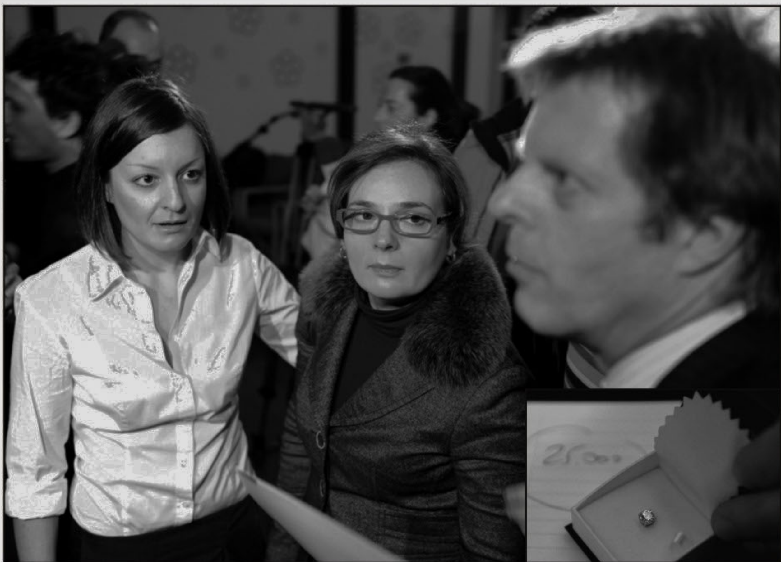
The unidentified woman (C), who bought a diamond-studded gold earrings (inset) of Argentine soccer legend Diego Maradona, is escorted after winning the auction for 25 000 euros in Bolzano, northern Italy, yesterday.

Maradona is now coach of Argentina's national team, which he led through tense qualification for the World Cup finals in South Africa this summer.