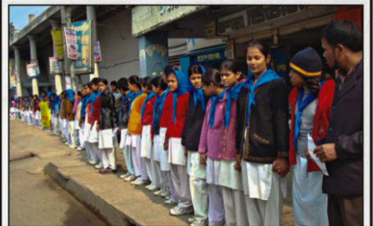
Action Committee for Implementation of North Rajshahi Irrigation Project forms a human chain in Chapainawabganj town yesterday demanding early implementation of the project to save the northern region from desertification.