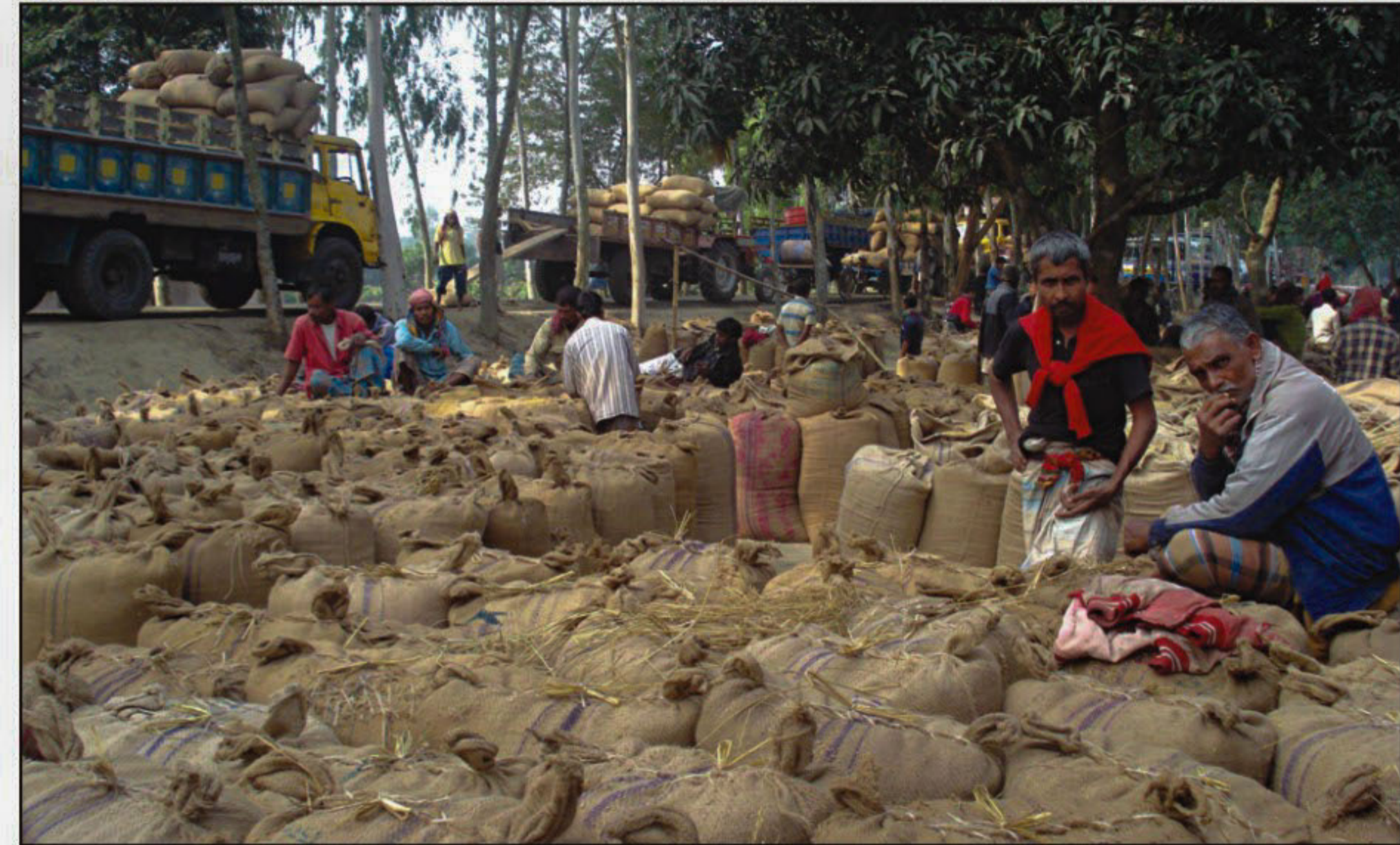
Bags of rice being loaded onto trucks as traders from 'outside' prepare to transport the item to different districts from Panchbarihat in Dinajpur Sadar upazila yesterday.

Thakurgaon district produced 3,23,850 tonnes of rice from 1,27,500 hectares of land [2.54 tonnes per hectare], Joypurhat produced 1,80,000 tonnes of rice from about 72,000 hectares land [2.5 tonnes per hectare] and Panchagarh district got 1,19,370 tonnes of rice from 51,900 hectares [2.3 tonnes per hectare], said DAE officials concerned.