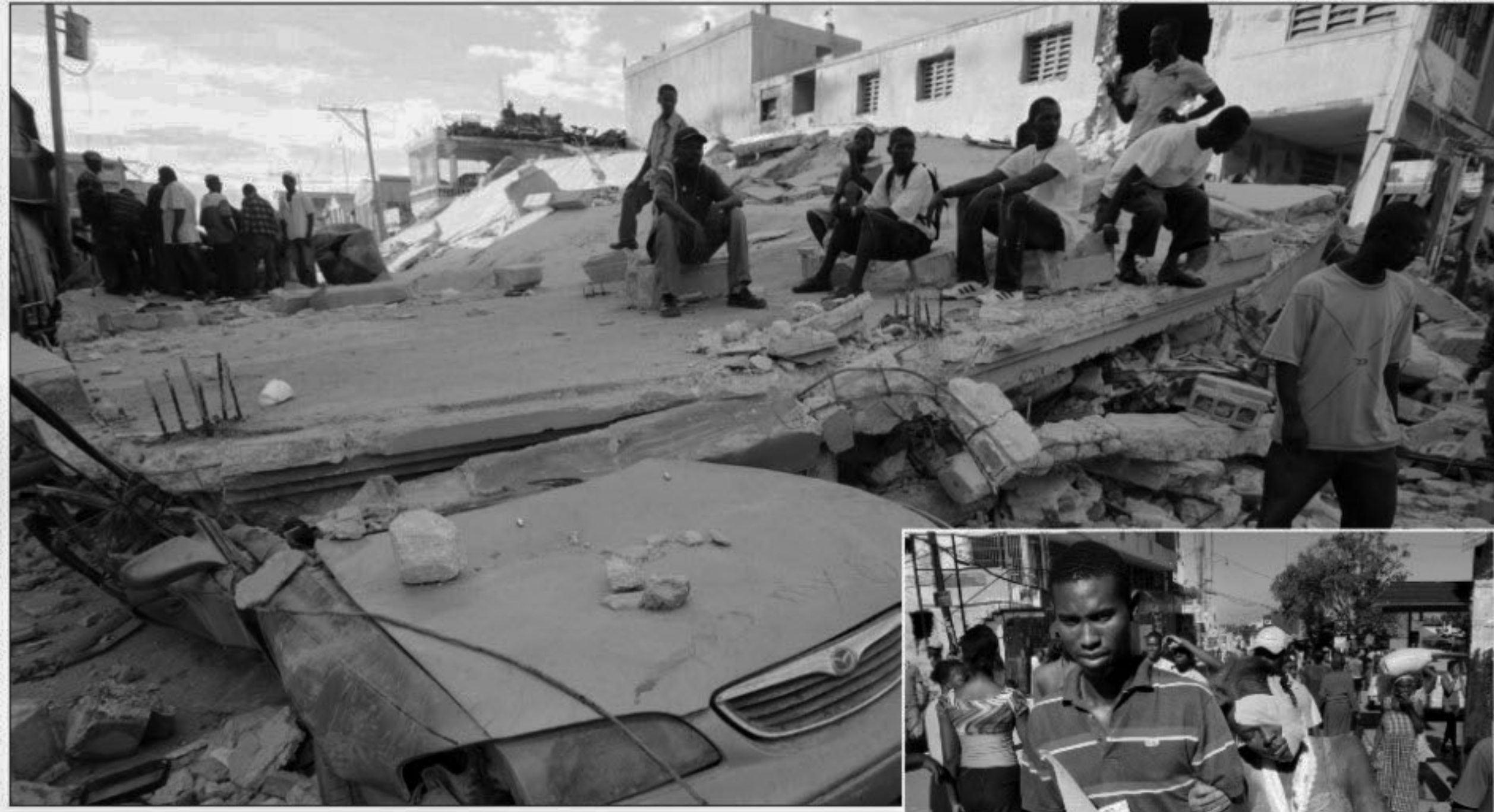
Survivors stand on the roof of a demolished house after a massive earthquake in Port-au-Prince on Wednesday while an injured woman is helped after being rescued (Inset). More than 100,000 people were feared dead in Haiti Wednesday after a calamitous earthquake razed homes, hotels, and hospitals, leaving the capital in ruins and bodies strewn on the streets.