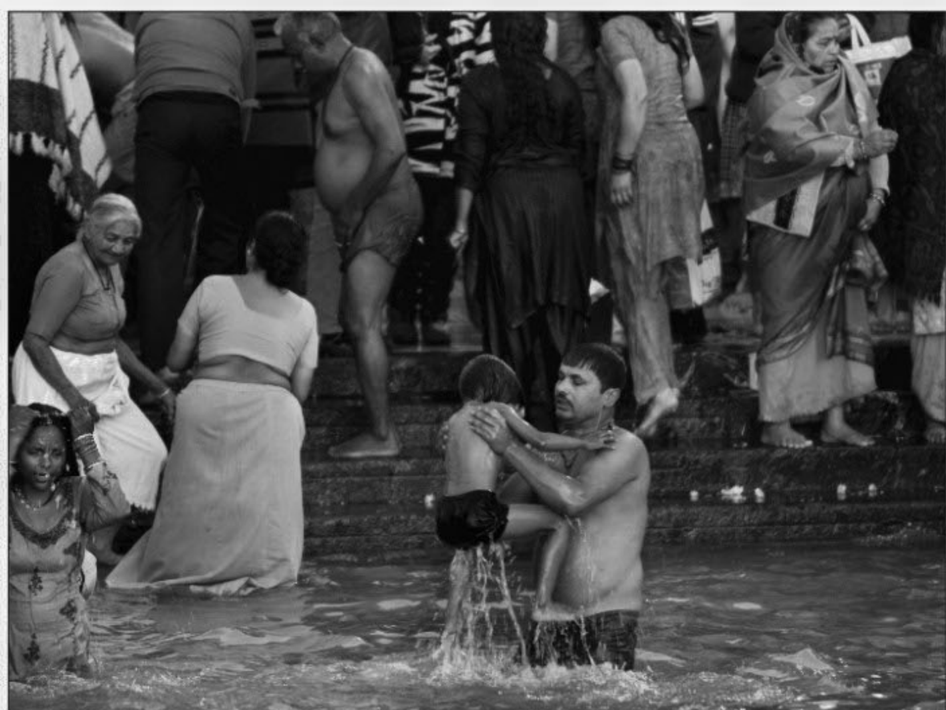
An Indian Hindu devotee holds his child as they bathe on the banks of the river Ganges in Haridwar yesterday during the Kumbh Mela (Pitcher festival), on one of the festival's main bathing days, Makar Sankranti. Hundreds of thousands of Hindu devotees took a ritual bath in India's holy Ganges before daybreak as one of the world's largest religious gatherings got underway.