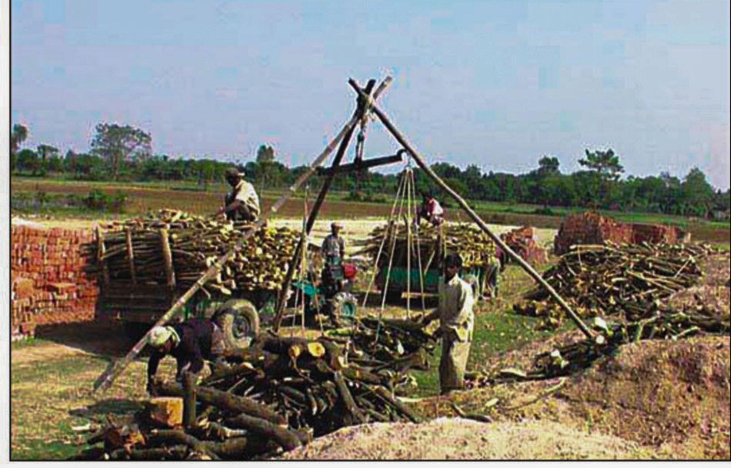
Huge amount of logs are piled on the premises of an unlicensed brick kiln in Jessore as callous people continue using trees as firewood for baking bricks, defying environmental laws.