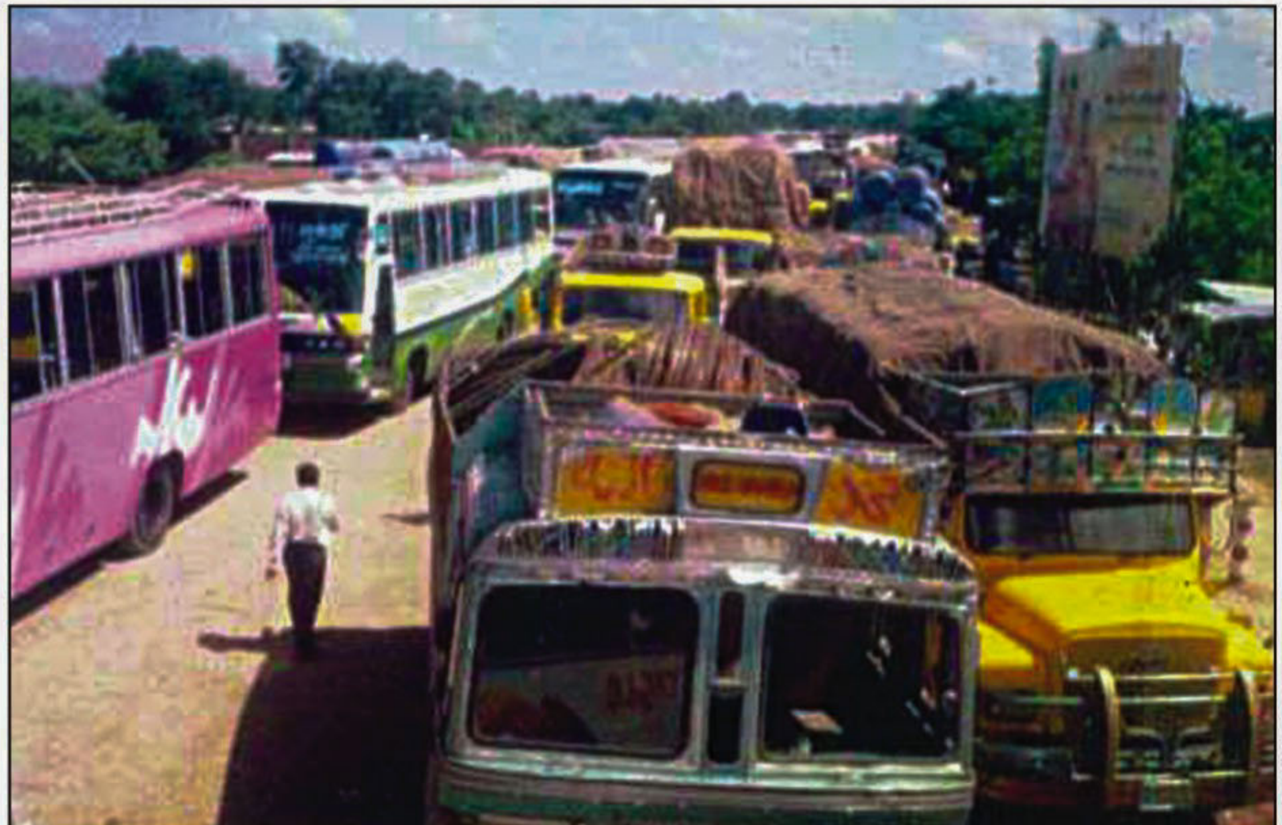
A large number of vehicles get stranded at Paturia ferry terminal as plying of ferryboats on Paturia-Doulatdia route remained suspended yesterday due to dense fog caused by the countrywide cloud wave.