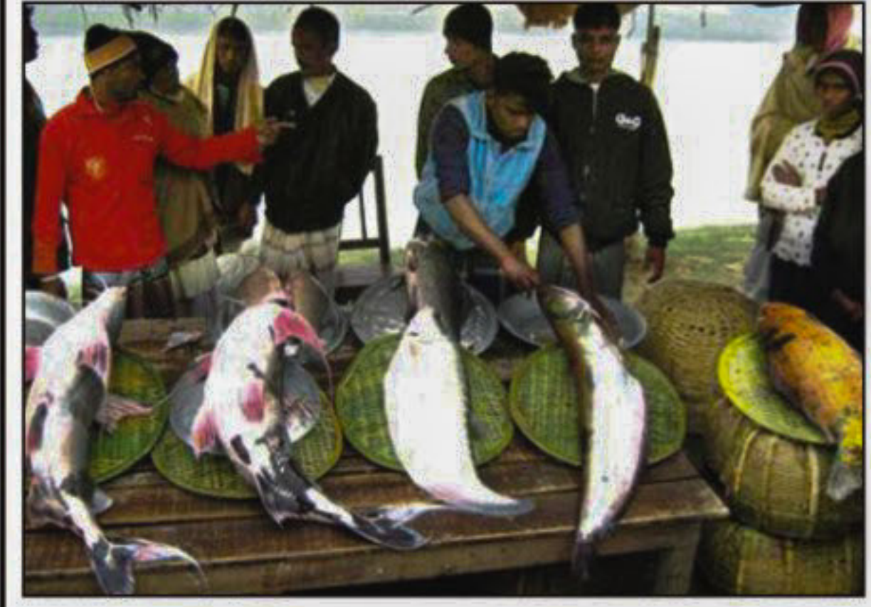
A variety of fishes are on display at the traditional yearly fish fair at Sherpur, 20 kilometres from Mouvibazar town. The two-day fair marking Poush Sangkranti, the last day of the Bangla month of Poush, ended yesterday.