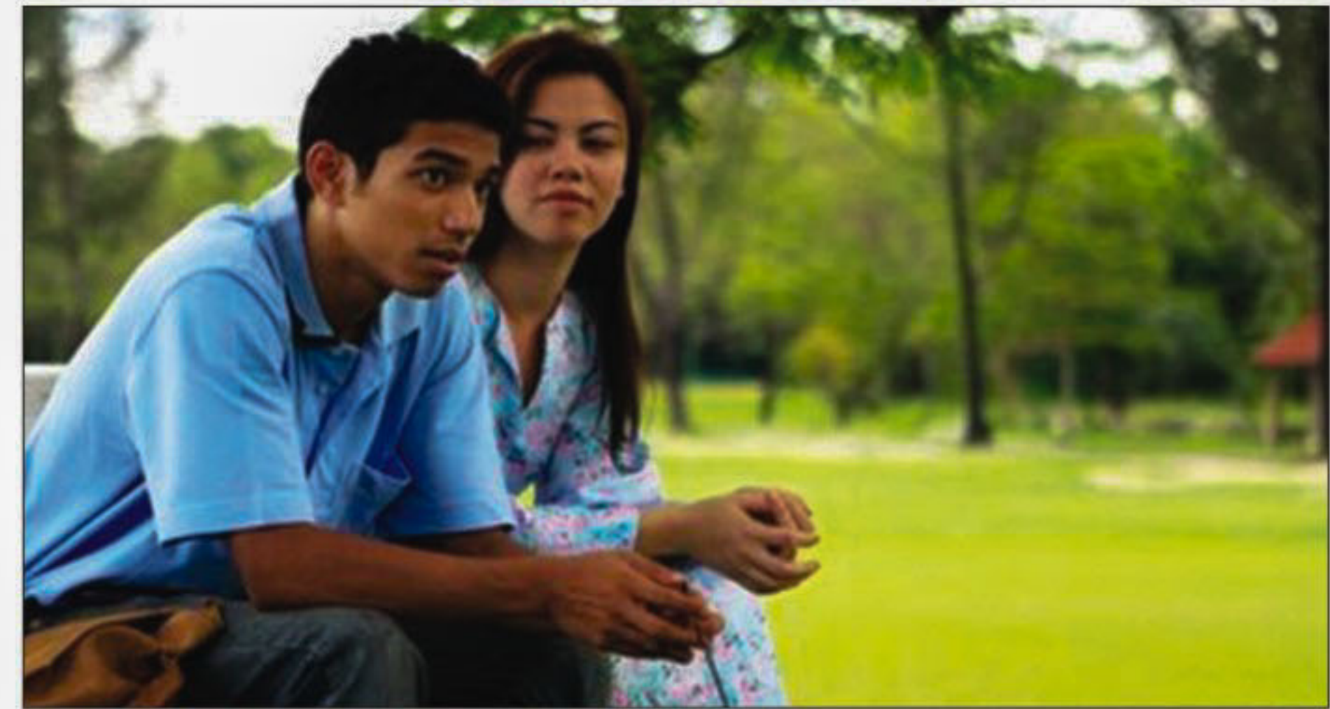
A scene from "Tale N Time", opening film of the festival today.