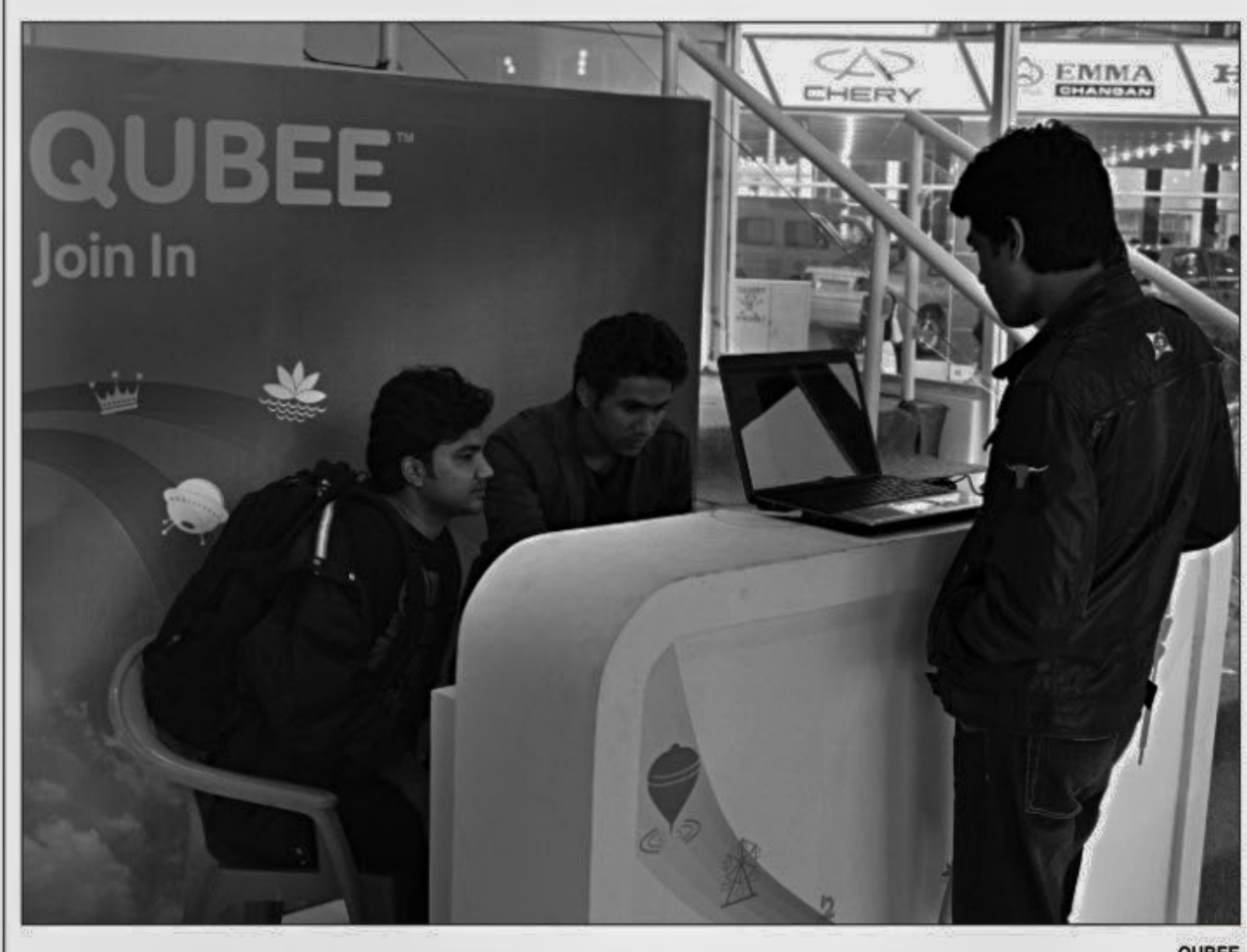
A visitor browses internet at a QUBEE WIMAX outlet at the 15th Dhaka International Trade Fair. Visitors and pavilion owners can use QUBEE wireless services for free within the fair premises.

If successfully implemented, PPPs would make an important contribution to economic growth and poverty reduction through investment in social infrastructure, transport and power, Rahman observed.