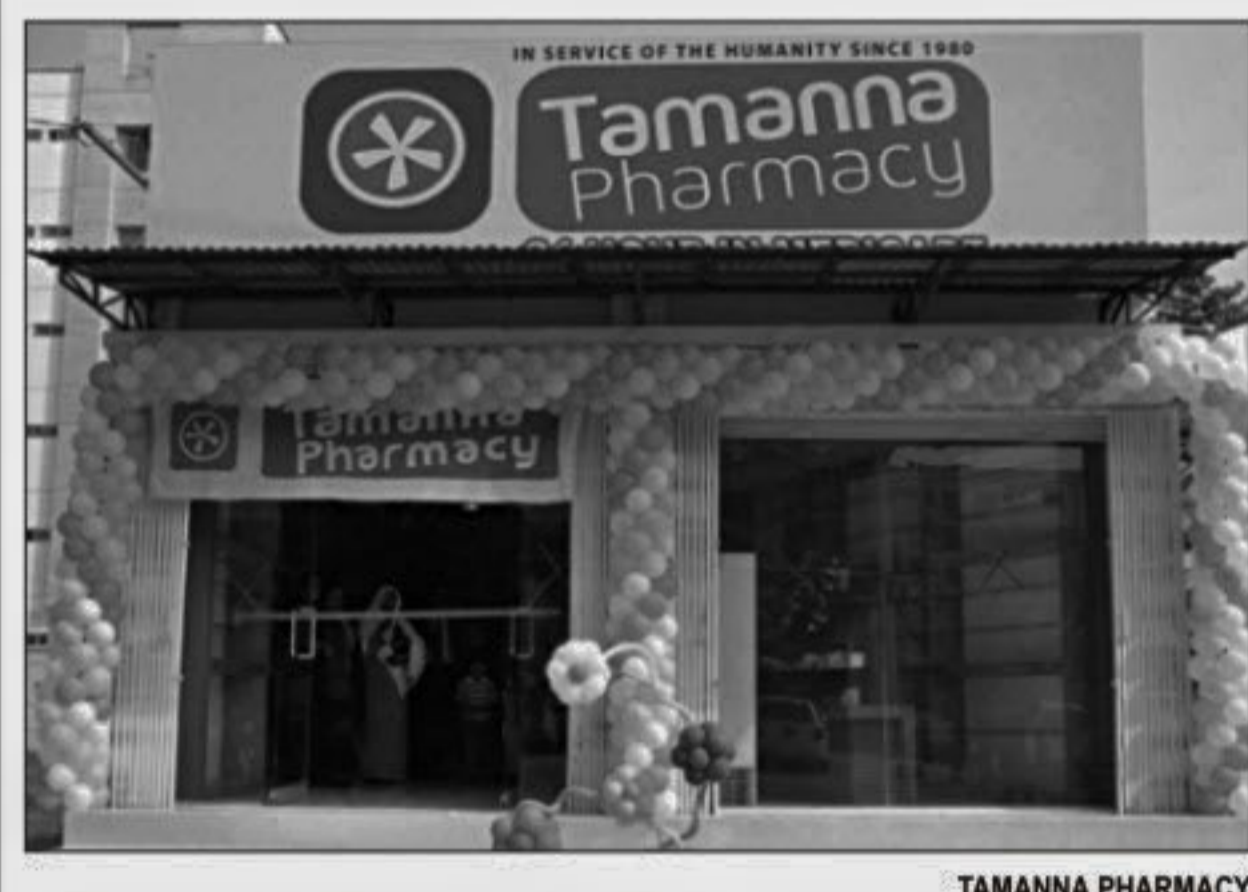
Tamanna Pharmacy has launched its new outlet near Apollo Hospitals in Bashundhara Residential Area in Dhaka recently.

Pointing his finger at the sick clients of the development bank, the parliamentary body chief said, "We have told the new bank officials to come up with a list specifying the very sick, sick and well running companies so that the list come under review in the committee's next meeting."