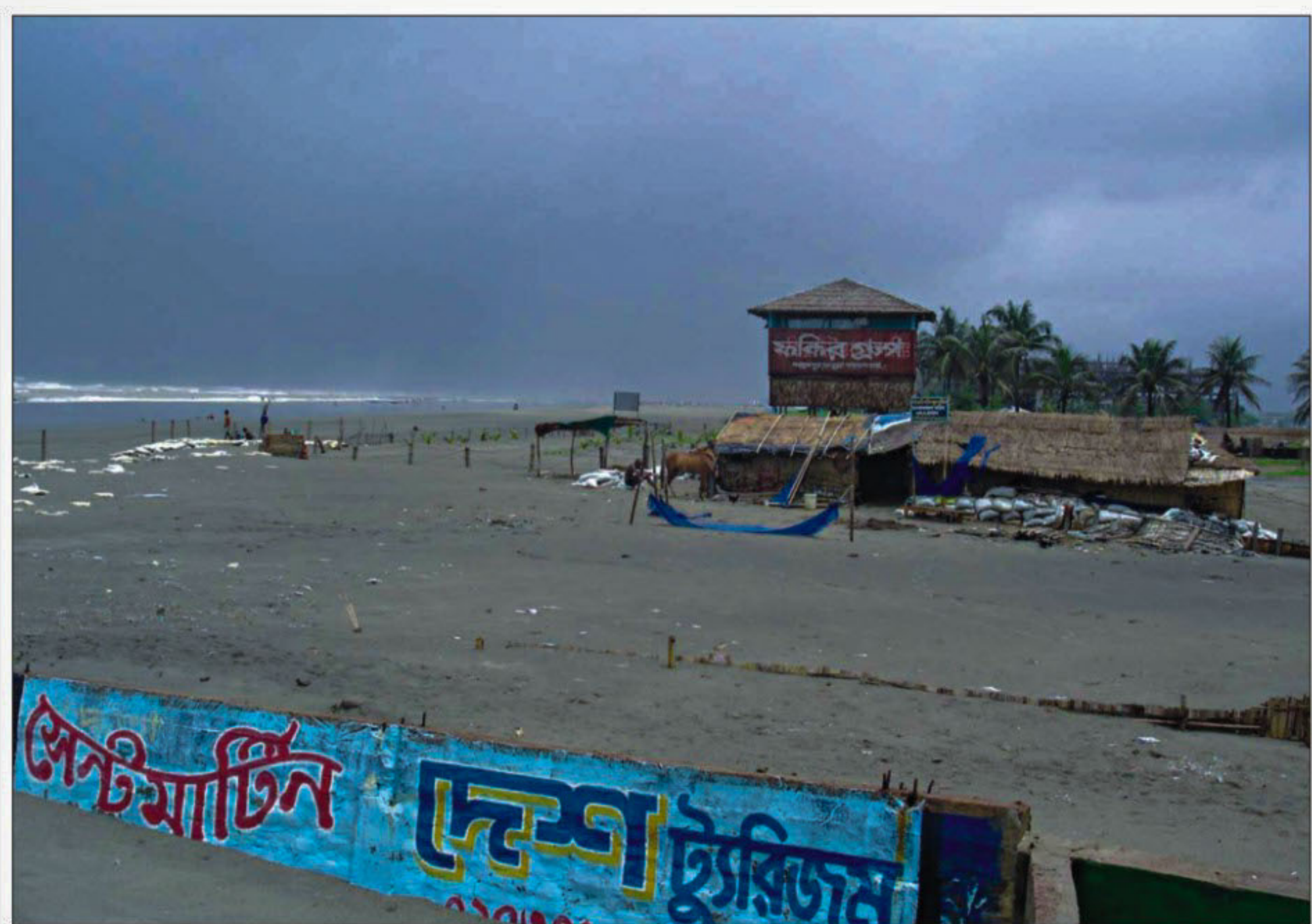
This file photo shows that lease on a number of plots in Cox's Bazar Hotel-Motel Zone have been violated because no construction work has taken place. The lease of these plots was cancelled yesterday.