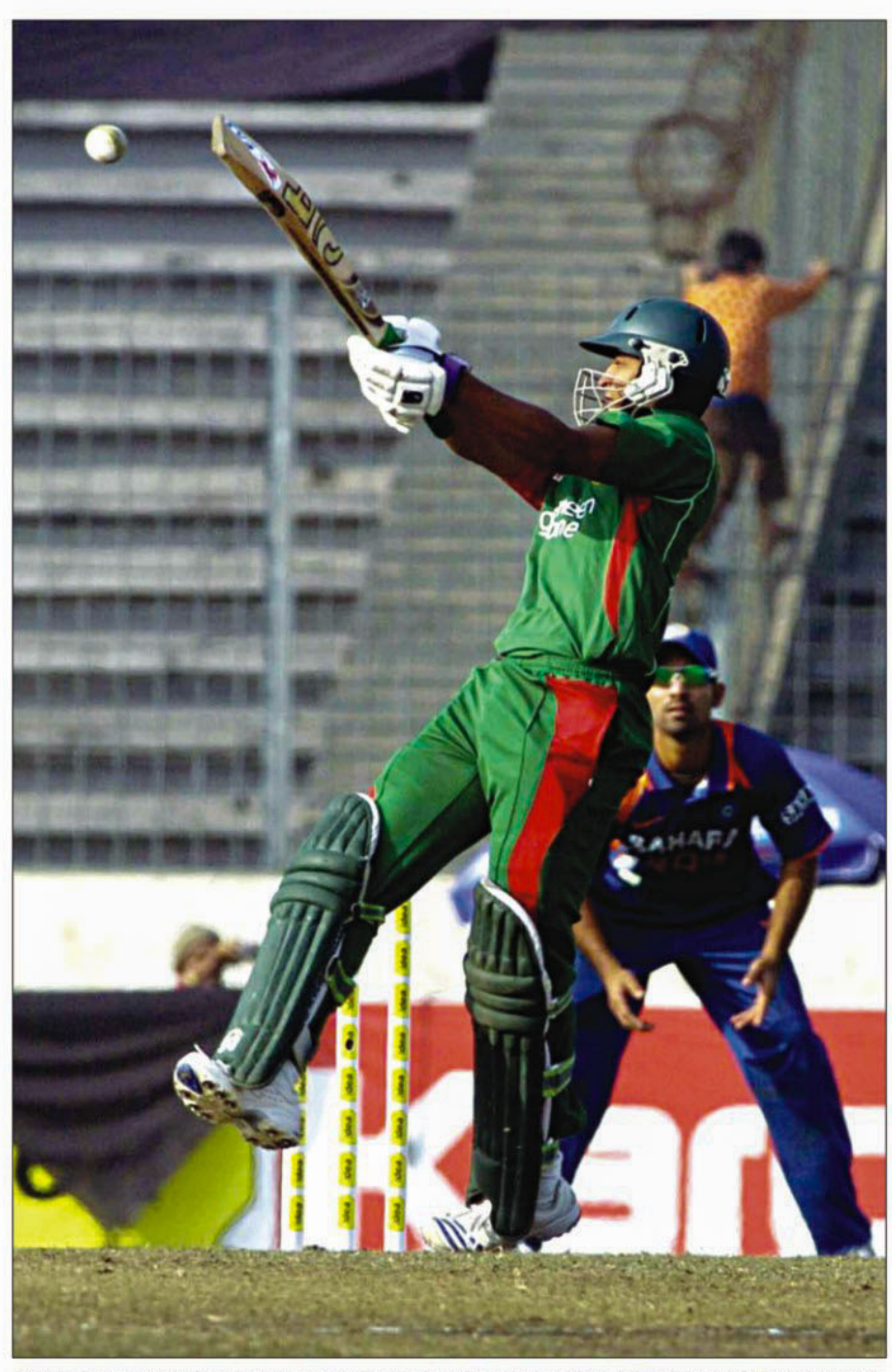
Bangladesh captain Shakib Al Hasan pulls one for a four during his sublime knock of 85 against India in the sixth one-day international of the Idea Cup tri-series at the Sher-e-Bangla National Stadium in Mirpur yesterday.