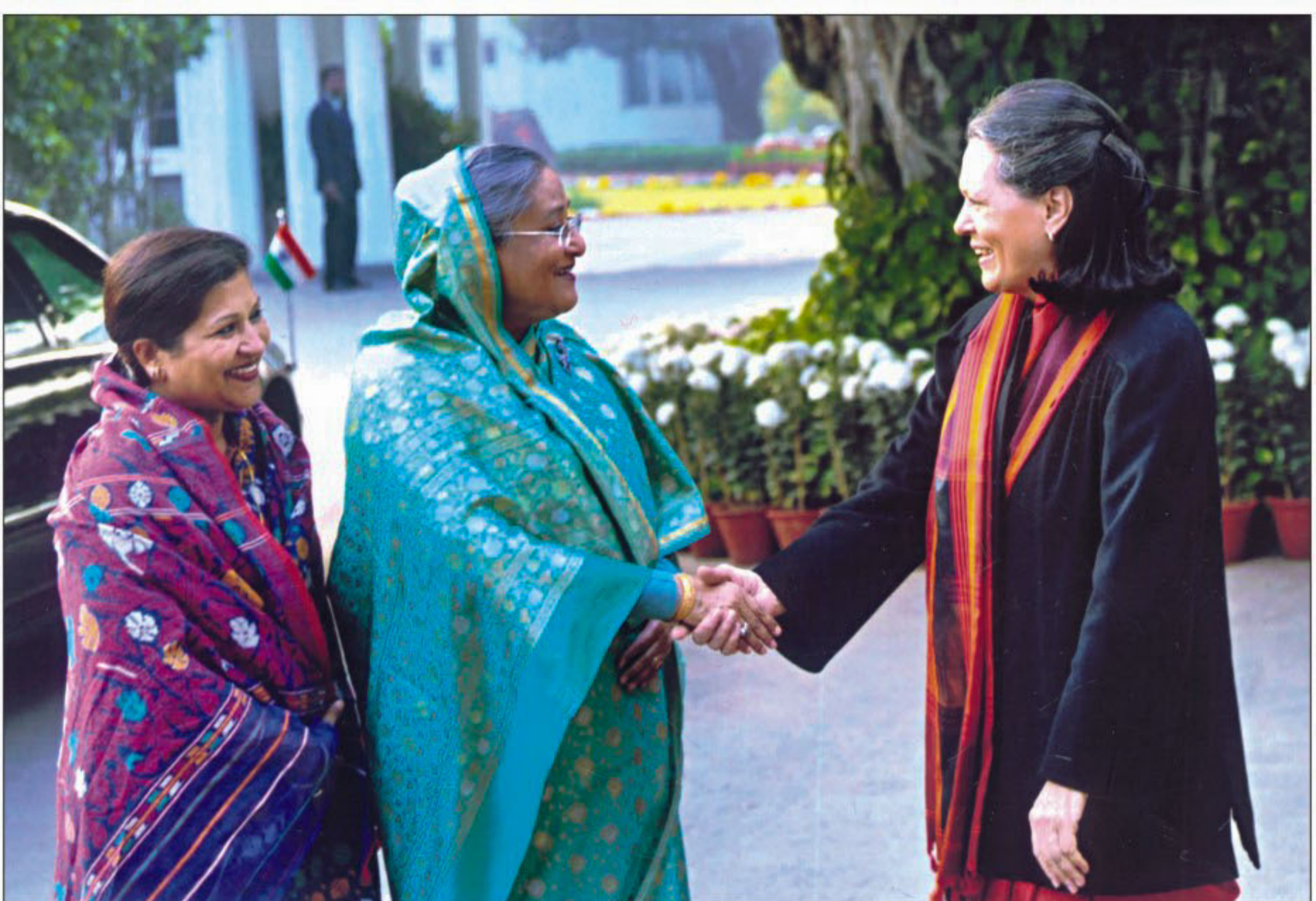
Prime Minister Sheikh Hasina is greeted by Sonia Gandhi, the chairperson of India's ruling United Progressive Alliance, at the latter's 10 Janpath residence in New Delhi yesterday.