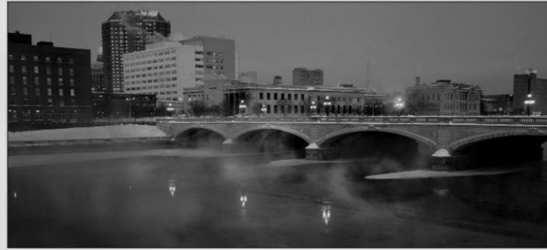
Extremely frigid temperatures cause steam to rise above the Des Moines River on Saturday in downtown Des Moines, Iowa, USA. The Midwest is bracing for another round of heavy snow and wind chills as low as 50 degrees below zero according to the National Weather Service.

two out of three trains under the English Channel. The weather, which forecasters said was caused by a rare depression that they had called "Daisy", unleashed blizzards in northern Germany that left motorways, other roads and railways in impassable at certain points. Hundreds of people were stuck in their cars and lorries in snow, or in trains, overnight and on Sunday morning, authorities said.