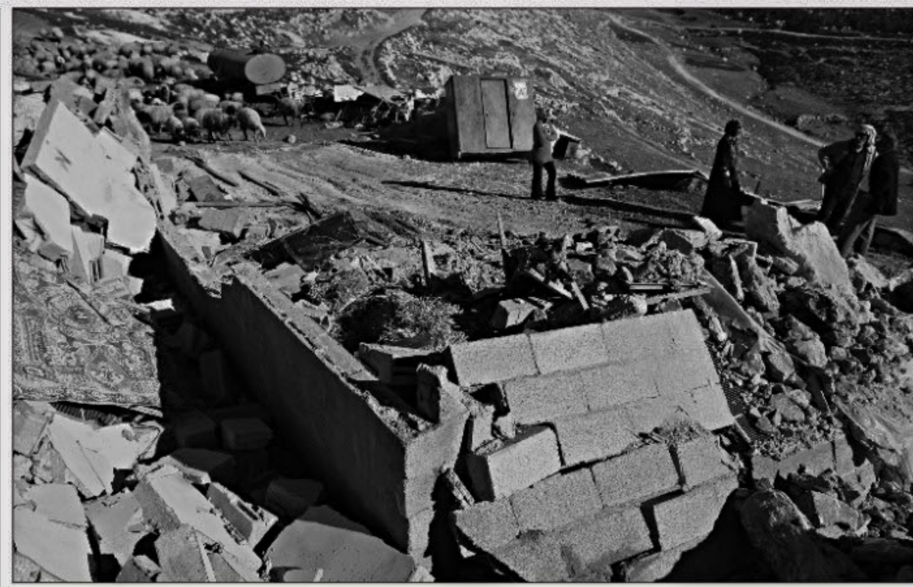
Palestinians stand next to their demolished home yesterday in the farming village of Tana near Nablus in the so-called Area C, a closed military zone where Israel exercises full control.