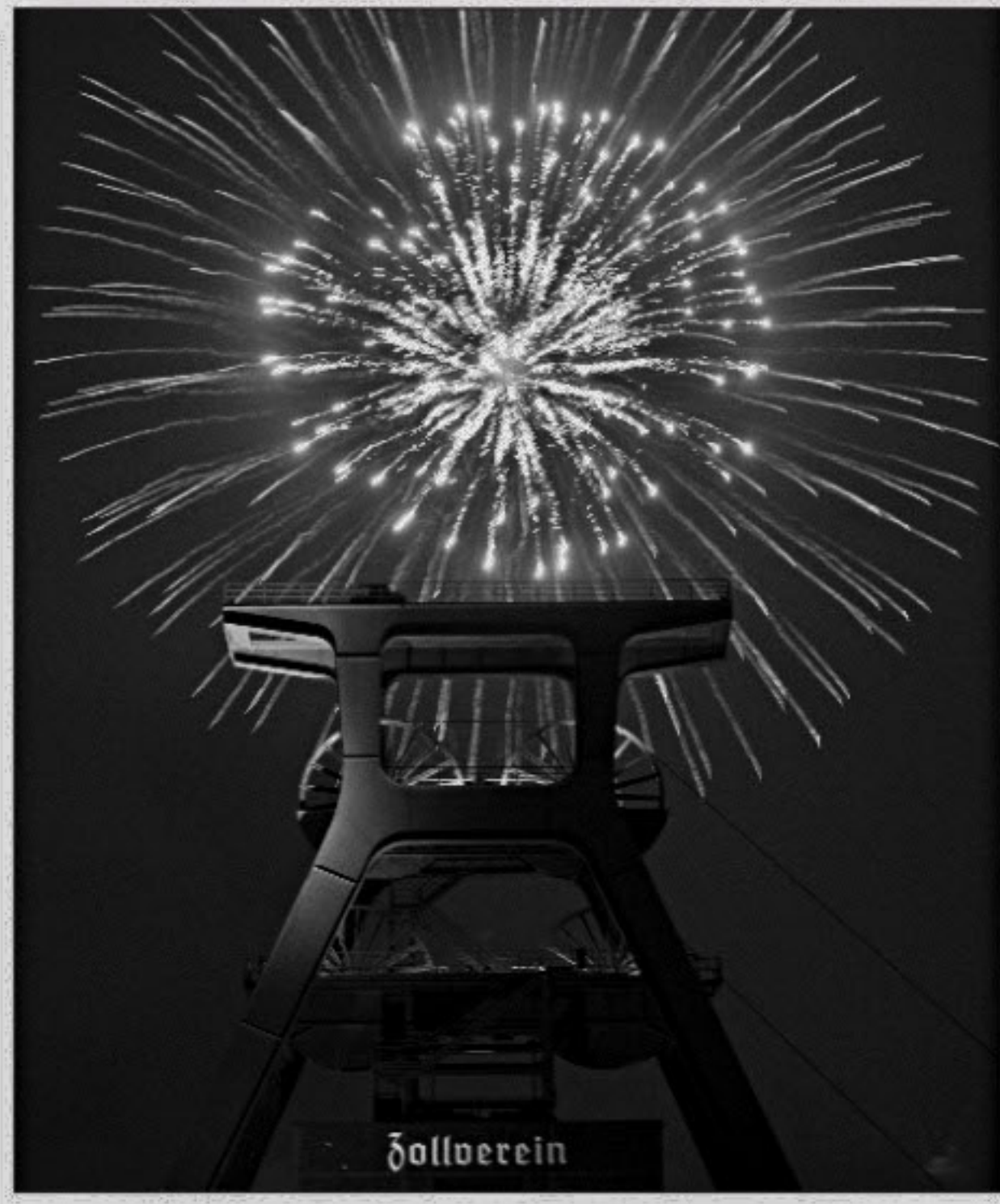
Fireworks explode behind the "Zeche Zollverein" during the opening ceremony of the "Ruhr.2010" cultural capital event on Saturday in Essen, western Germany. The "Zeche Zollverein", a former colliery, is on the Unesco list of World Heritage Sites and will be one of the places in the Ruhr area where the Ruhr 2010 will be celebrated as cultural capital during one year with many events in arts, architecture, music, theatre and dance.