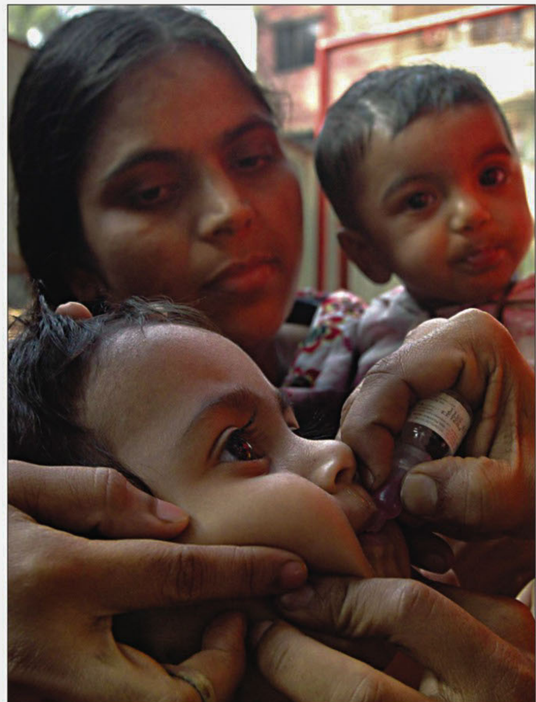
A child receives polio vaccine at a centre at Mirpur in the city as the 18th National Immunisation Day was observed across the country yesterday.

"What is interesting is coming from different backgrounds and families who cannot afford education for their kids; they get adapted to a multicultural situation," she observed.