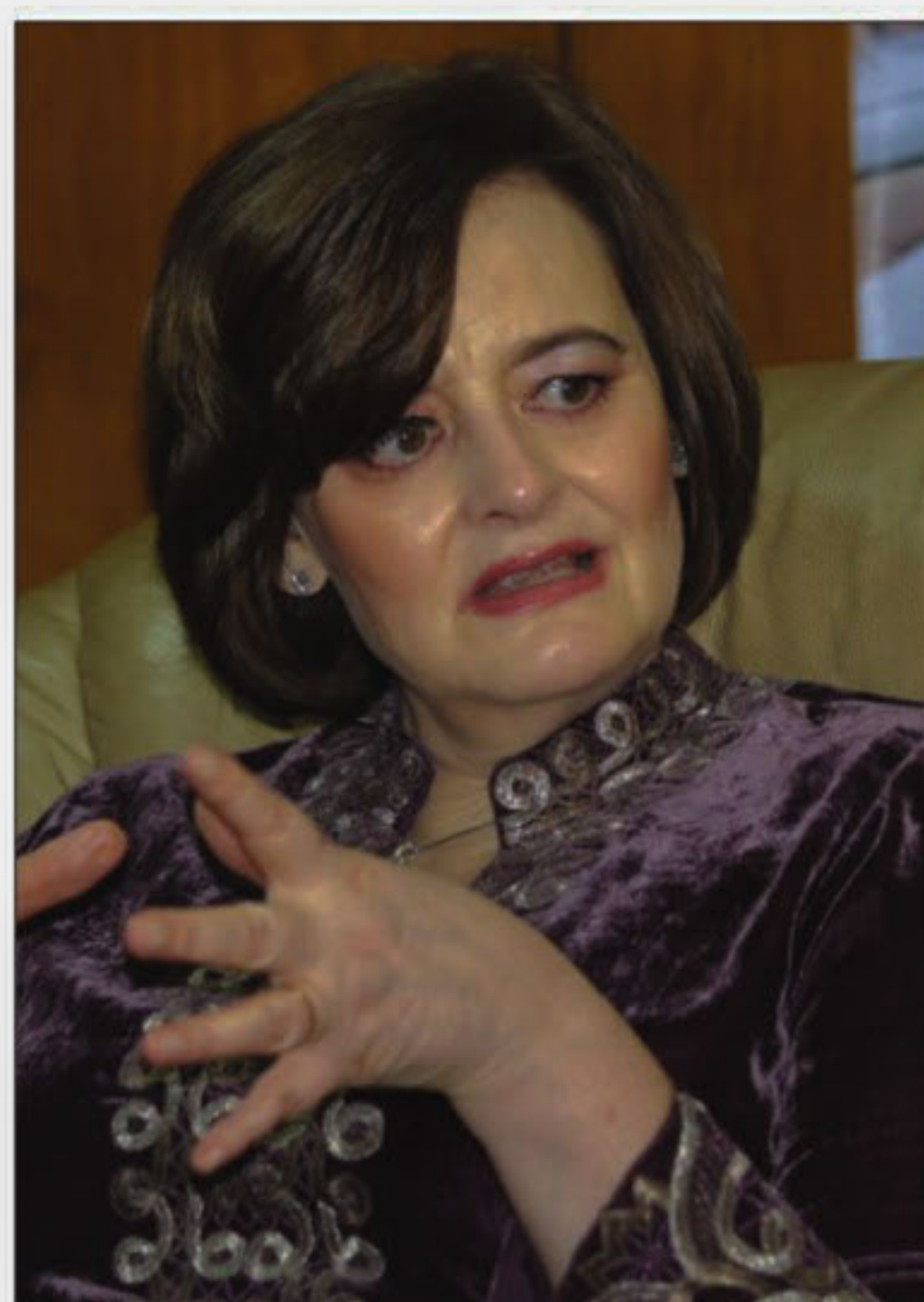
Cherie Blair, wife of former British prime minister Tony Blair and a leading human rights activist, makes a point during an interview with The Daily Star in the city yesterday.

"No country in the world has closed the gender gap and in this context Bangladesh gets high scores for having women leadership and women's education. For example, in Bangladesh women get free education up to higher level which is very apprecia-