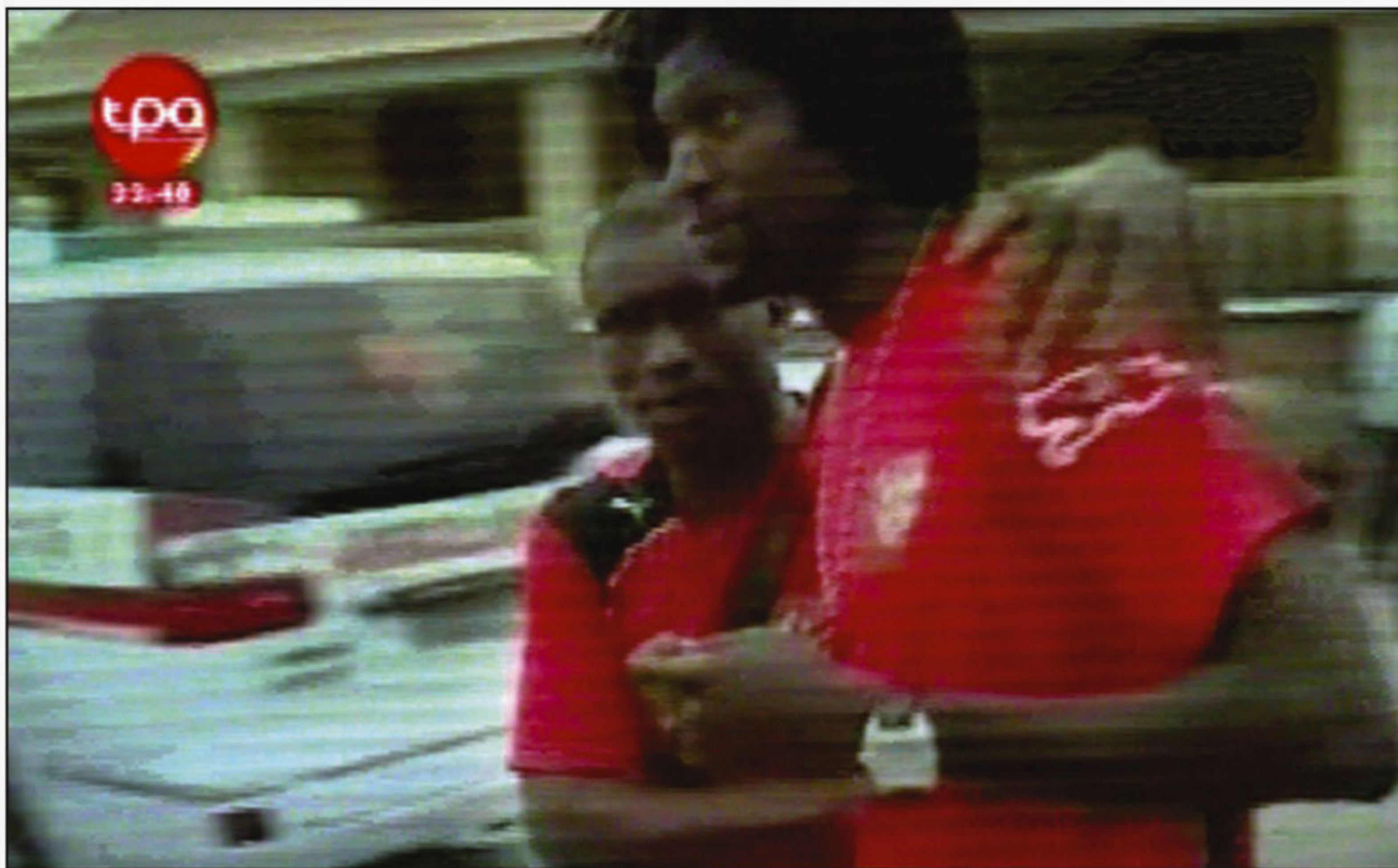
A photo grab from Televisao Publico de Angola shows Togo captain Emmanuel Adebayor (R) being comforted by an unidentified teammate in Cabinda on Friday. Adebayor said that many of his teammates wanted to leave the African Nations Cup after gunmen opened fire on the bus carrying the team to the tournament in Angola.

Despite long-running security concerns, oil-rich Cabinda is to host seven Nations Cup matches this month in Angola's biggest sporting event since the end of a 27-year civil war in 2002.