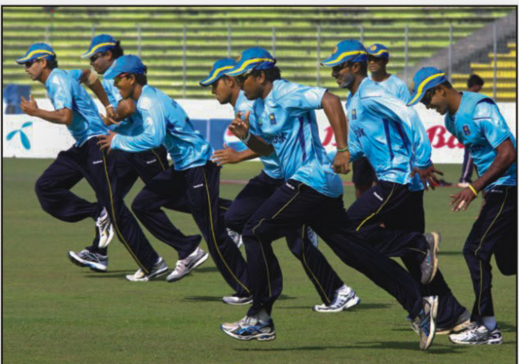
India batsman Yuvraj Singh (L) pulls a handspring while the Sri Lankan squad engage in drills on Saturday prior to their group match at the Sher-e-Bangla National Stadium today.