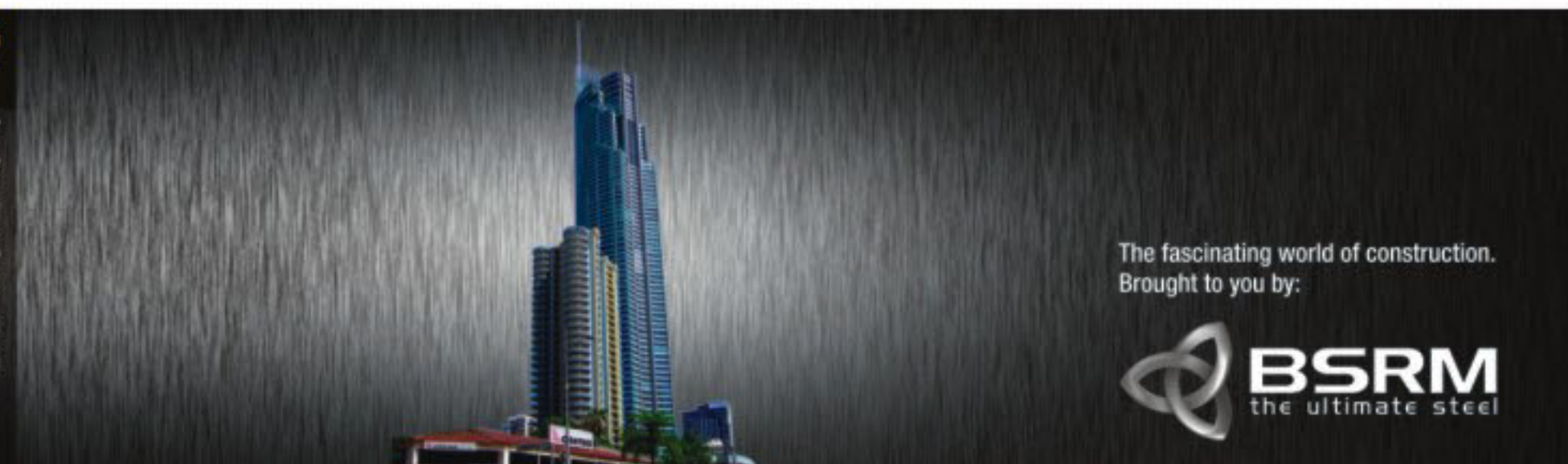
The fascinating world of construction. Brought to you by: BSRM the ultimate steel

Q1 (meaning Queensland Number One) is a supertall skyscraper located in Surfers Paradise, on the Gold Coast. At 322.5 meters, it is the world's tallest residential tower and the tallest building in Australia and the Southern Hemisphere.