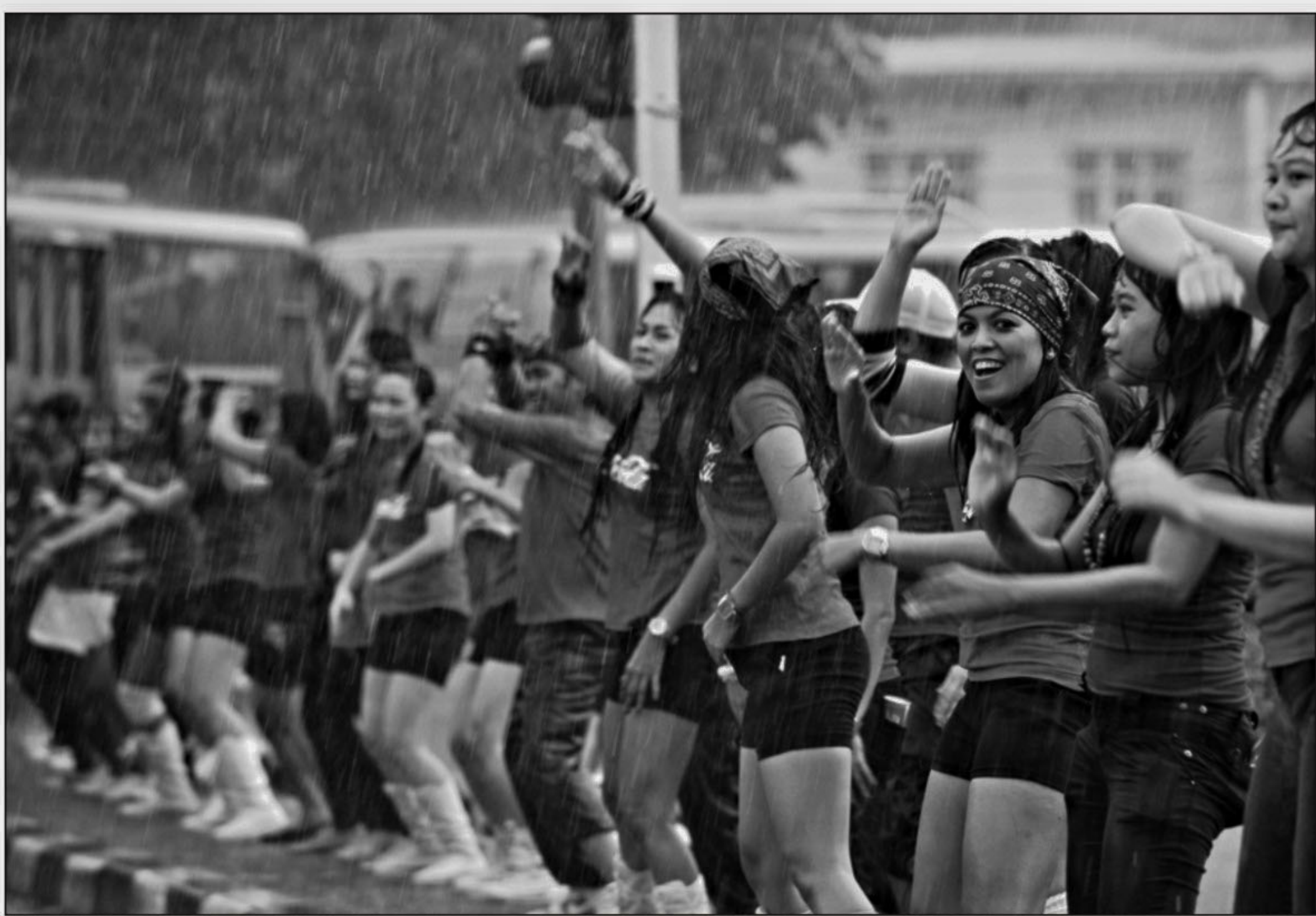
Indonesian youths dance as they attend a ceremony to welcome the FIFA World Cup trophy tour to Jakarta on Friday.