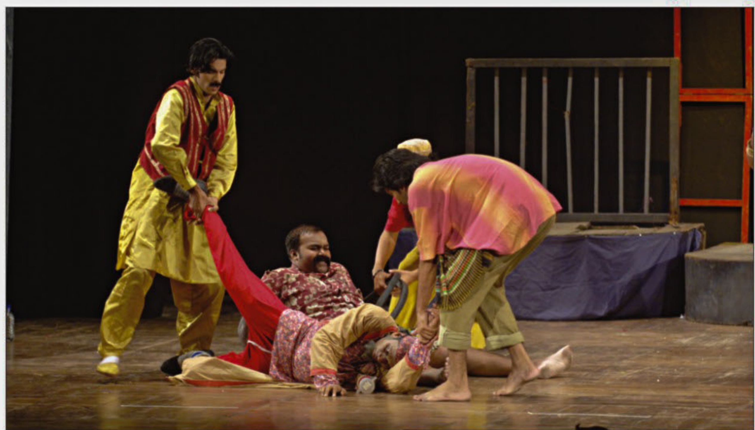
A scene from "Konjush".

Theatre troupe Loko Natya Dal will be holding the 550th show of "Konjush", an adaptation of the Moliere satire, "The Miser", at the National Theatre Stage today at 6:30 pm, says a press release.