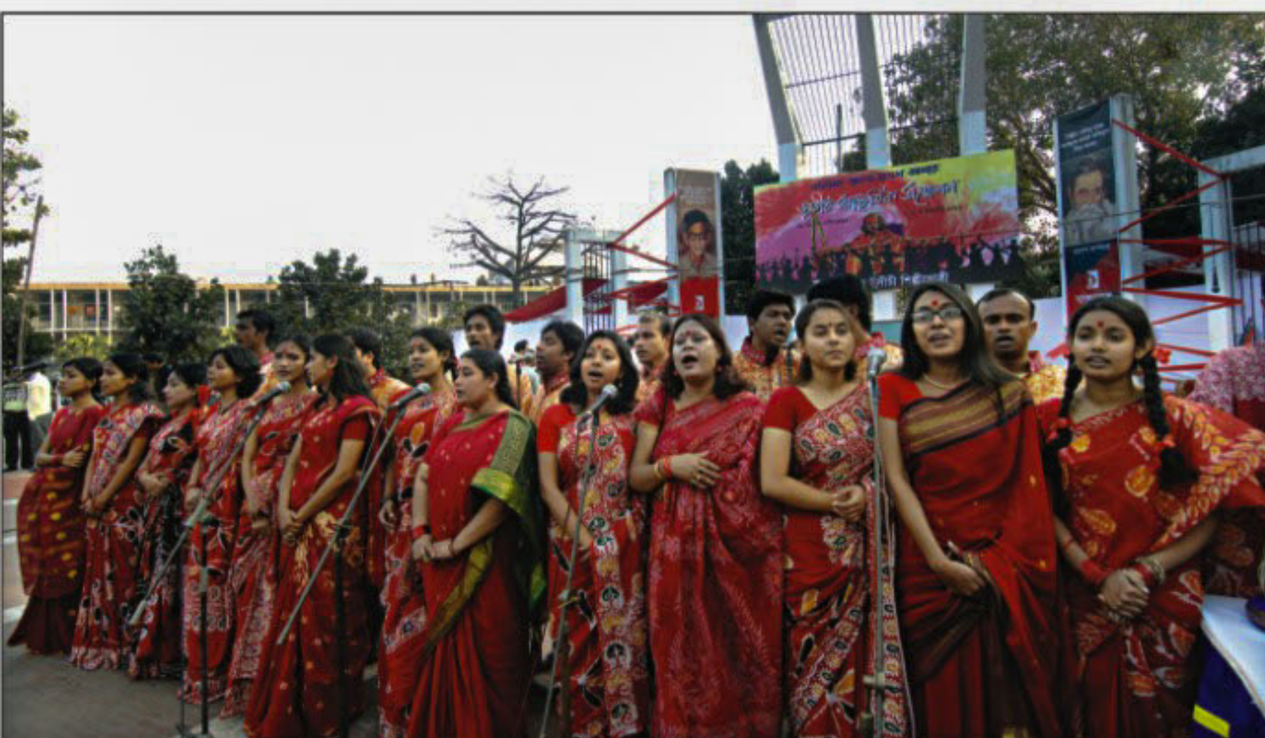
The chief guest and other dignitaries place a wreath at the Shaheed Minar (top); Udichi artistes perform at the cultural programme.