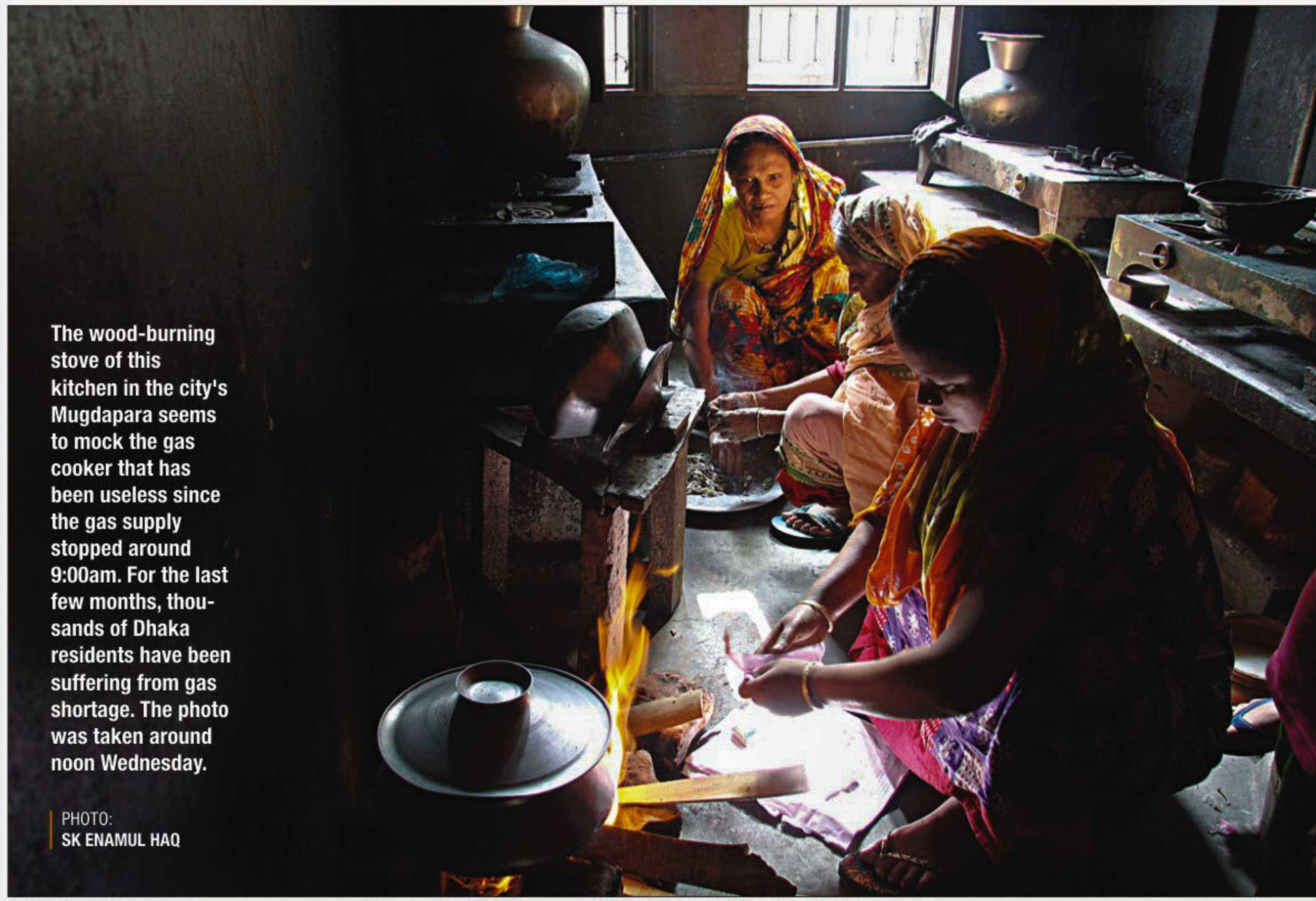
The wood-burning stove of this kitchen in the city's Mugdapara seems to mock the gas cooker that has been useless since the gas supply stopped around 9:00am. For the last few months, thousands of Dhaka residents have been suffering from gas shortage. The photo was taken around noon Wednesday.

situation and increased prices of stoves and LP gas cylinders. Golam Kibria, a shopkeeper in Kaptan Bazar, said sale of kerosene stoves increased three times over the last week. Its price has also increased by Tk 20-50 from Tk 140-160 in retail markets as a result of huge price increase in wholesale markets, he said. Nuruddin, who sells LP gas cylinders, said the price of Jamuna gas rose to Tk 1,080 per cylinder from Tk 1,010 within a week while that of Total gas rose to Tk 1,020 from Tk 880 within a month. The government initiative to keep city CNG filling stations shut for two days a week has meanwhile frustrated many owners, who complained that they are already facing huge trouble in running their business because of the ongoing gas crisis. They were forced to keep their stations shut for 10-12 hours because of the low pressure of gas, said officials of different filling stations in the city. Mir Rezaul Karim, an official of Dhaka Refilling and Servicing Centre at south SEE PAGE 15 COL 7