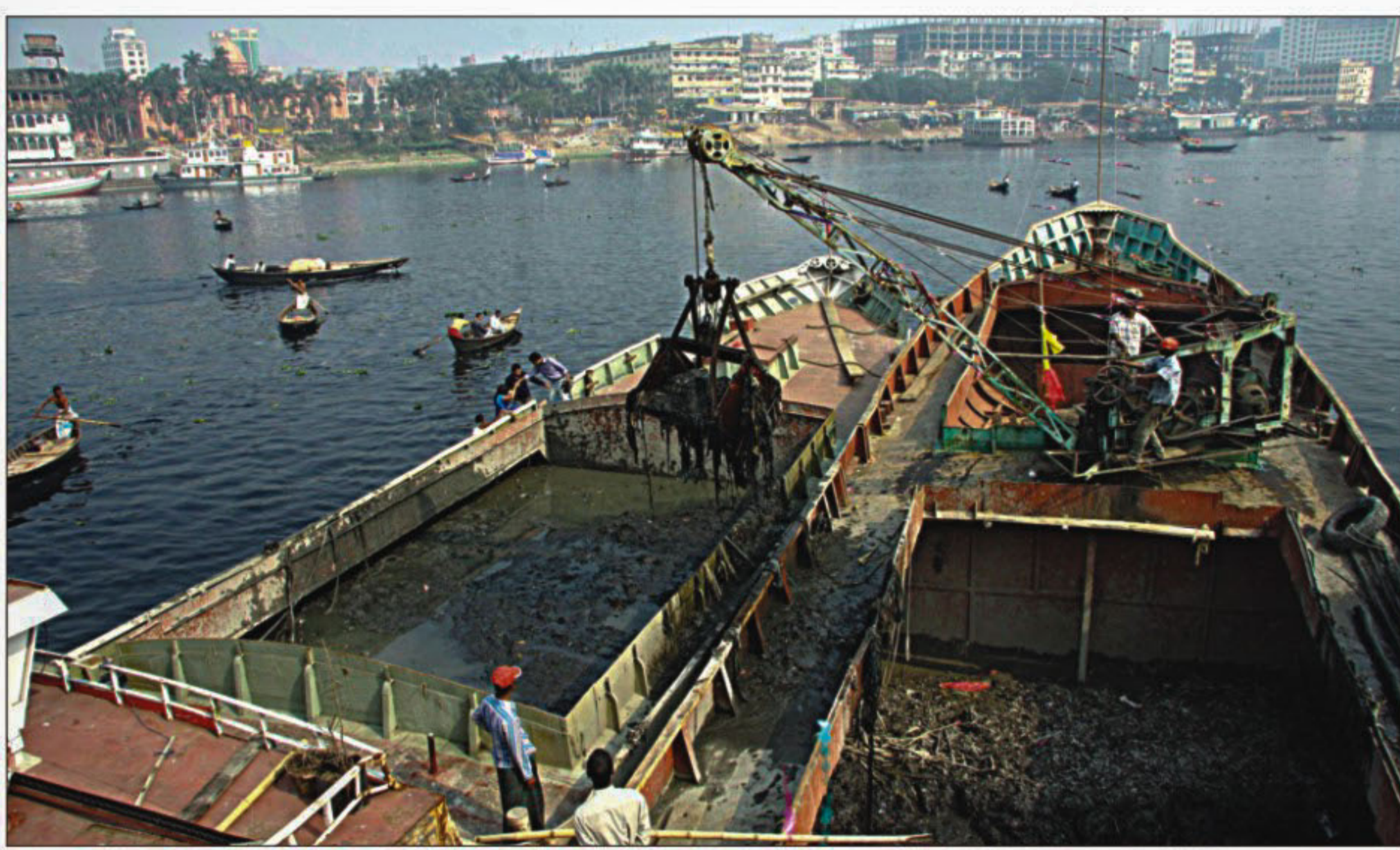
The photo taken yesterday near the second Buriganga Bridge in the city shows the BIWTA carrying out clean-up drive that started Wednesday to remove accumulated garbage from the riverbed.