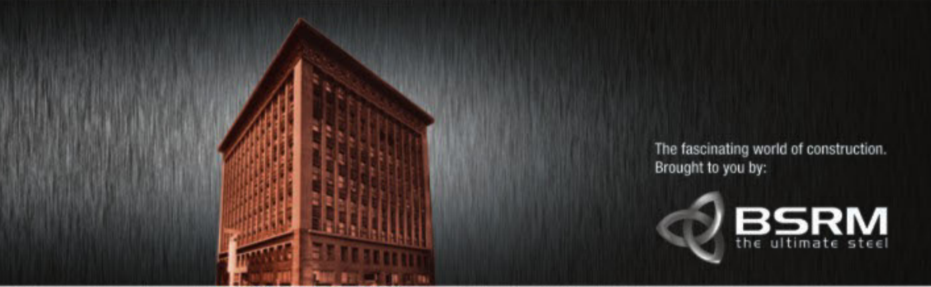
The fascinating world of construction. Brought to you by: BSRM the ultimate steel

Did you know? Sullivan's Wainwright Building in St. Louis, 1891, was the first steel-framed building with soaring vertical bands to emphasize the height of the building, and is, therefore, considered by some to be the first true skyscraper.