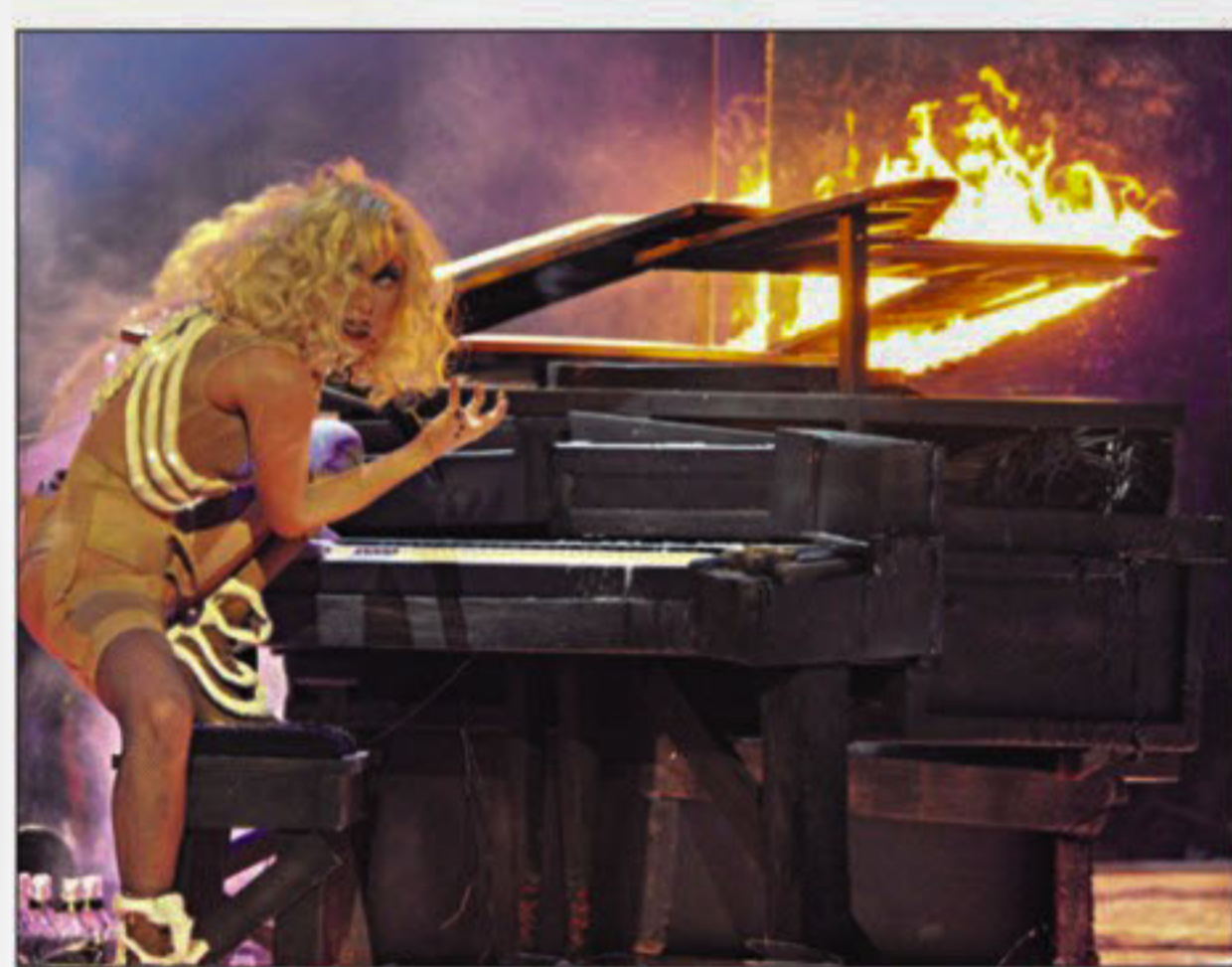
Lady Gaga performs at the 2009 American Music Awards.

This year's Grammys are shaping up to be a potentially big night for the ladies,