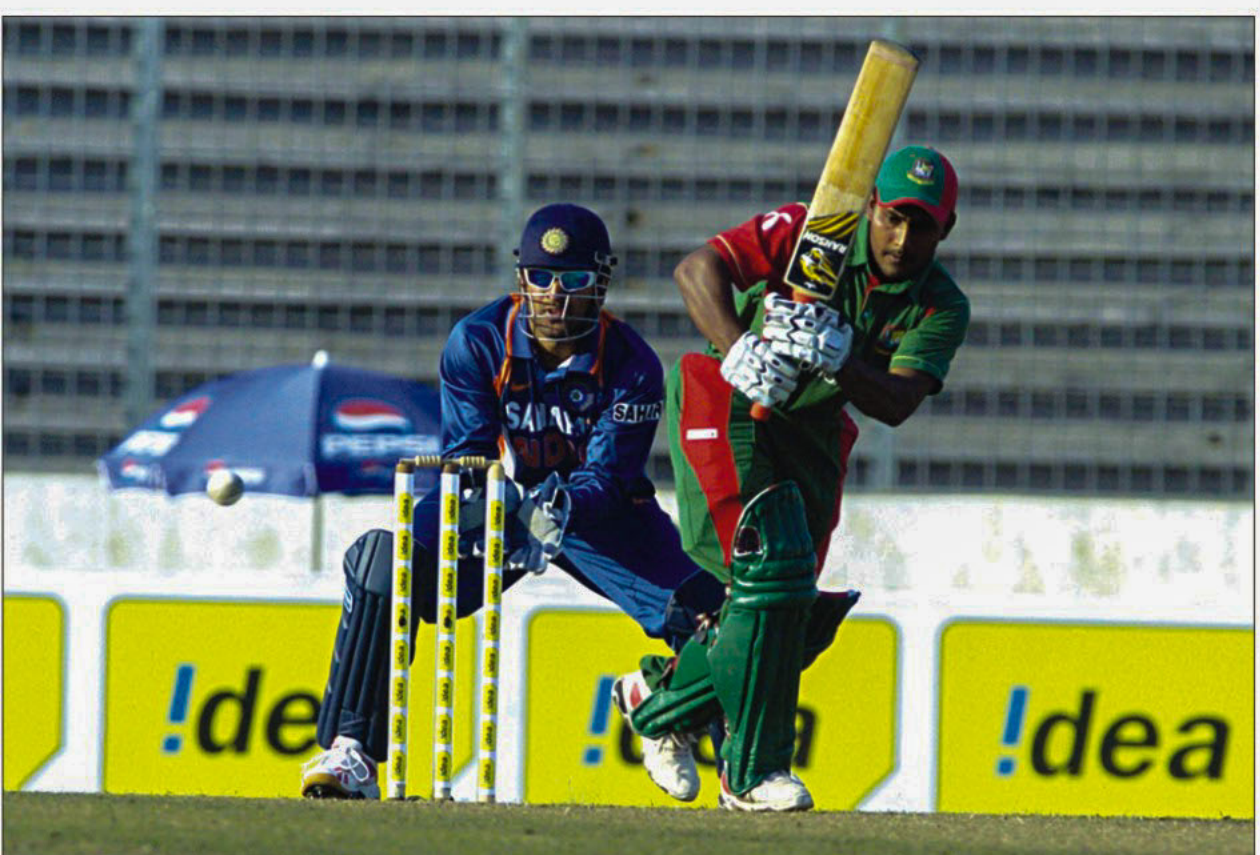
Bangladesh opener Imrul Kayes flicks the ball off his pads during his solid knock of 70 in their Idea Cup match against India at the Sher-e-Bangla National Stadium in Mirpur yesterday.

STAR REPORT The government still enjoys significant popular support with high approval rating for the prime minister, and favourable opinion about the government's efficiency including maintenance of law and order. However, the massive mandate with which the government came to power a year ago looks eroded to some extent, a DailyStar-Nielsen opinion poll reveals. Prime Minister Sheikh Hasina scored impressively high in approval rating outshining the popularity of her government. Khaleda Zia as the opposition leader scored a much lower rating than her archrival Hasina. The survey found an unusually high percentage of the people who did not know about any success or failure of the government. This testifies to a general failure of both the government and opposition to communicate with the people. The survey was conducted between December 17 and 25 last year among 3,050 respondents, all above 18 years of age. They were interviewed at 180 spots. SEE PAGE 15 COL 3