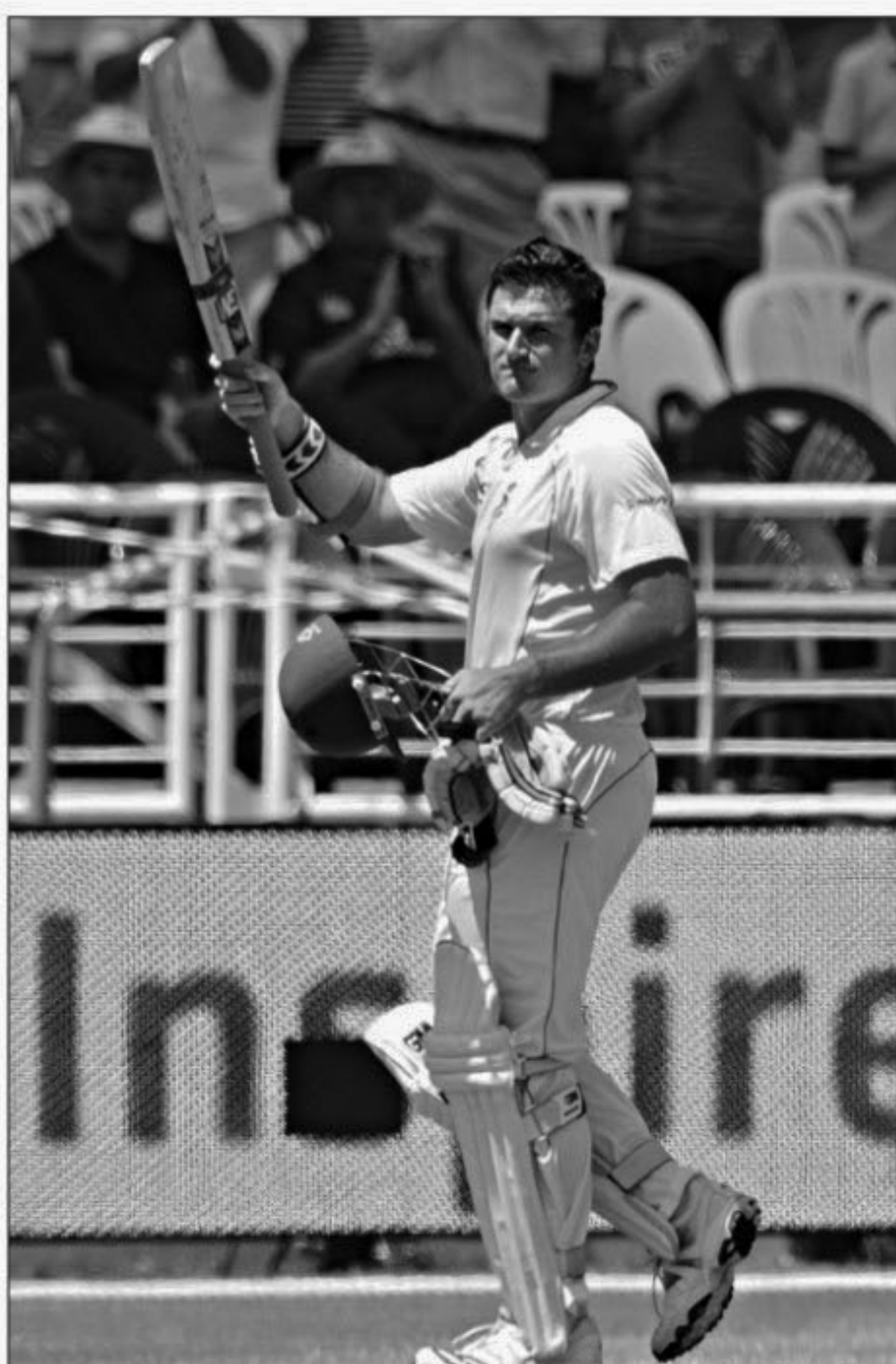
South Africa captain Graeme Smith salutes the Newlands crowd as he leaves the field after scoring a majestic 183 on the fourth day of the third Test against England in Cape Town yesterday.

Pakistan head to Hobart for the final Test, which is due to begin on January 14.