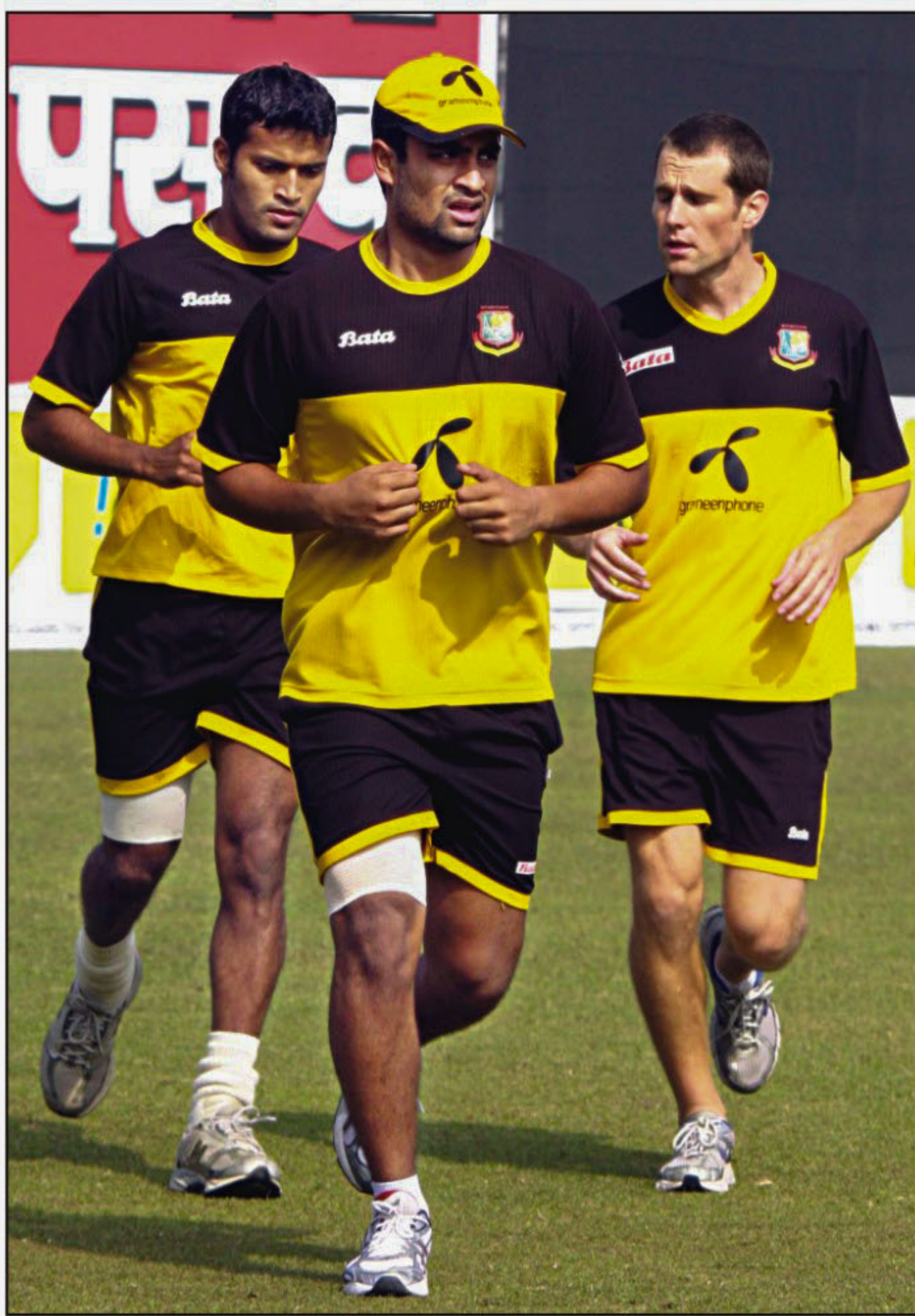
Bangladesh's explosive opener Tamim Iqbal (C) has the look of a determined man as he jogs with others yesterday on the eve of their crucial match against India today.