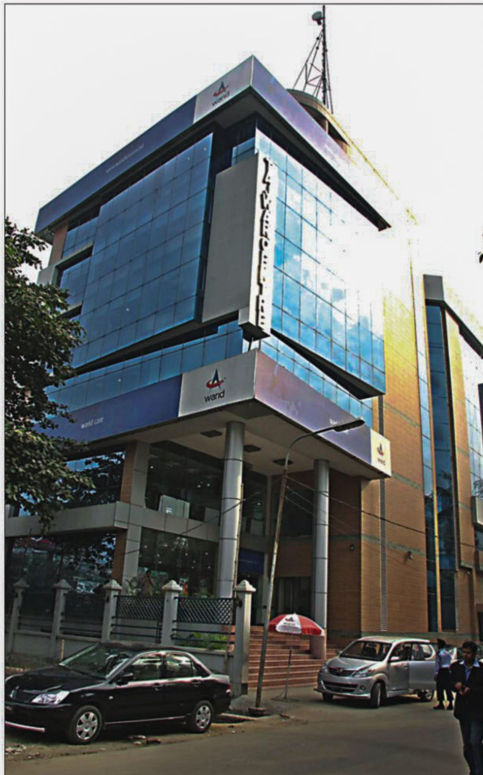
The headquarters of Warid in Dhaka. Indian telecom giant Bharti Airtel has got a go-ahead from the telecom regulator to buy a 70 percent stake in Bangladesh's fourth largest mobile operator.

State-run Teletalk could be the next operator to go for partnership