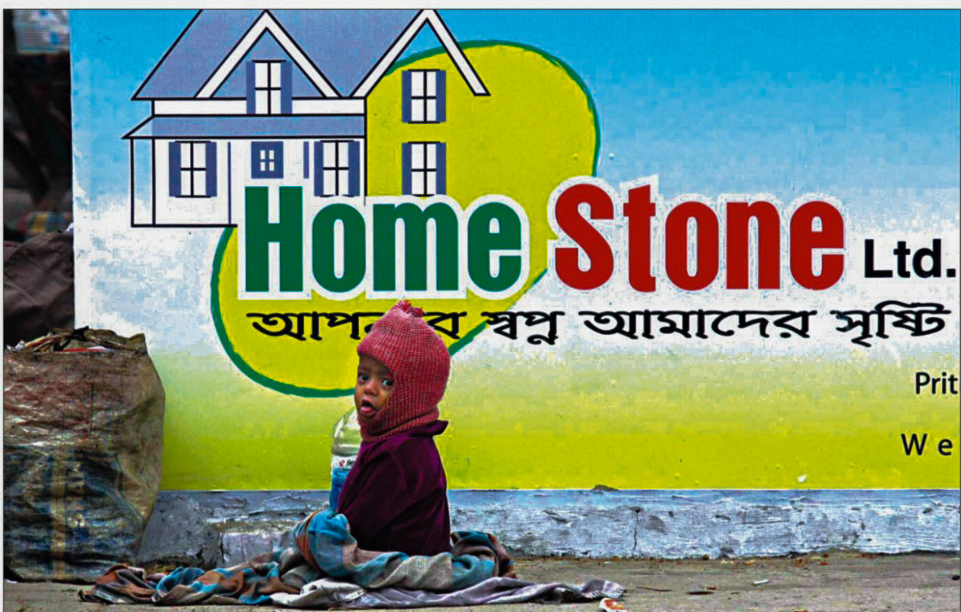
A homeless child endures severe chill under open sky amid cold wave in the city yesterday morning. The photo was taken in front of the Shiksha Bhaban, Dhaka around 8:00am.