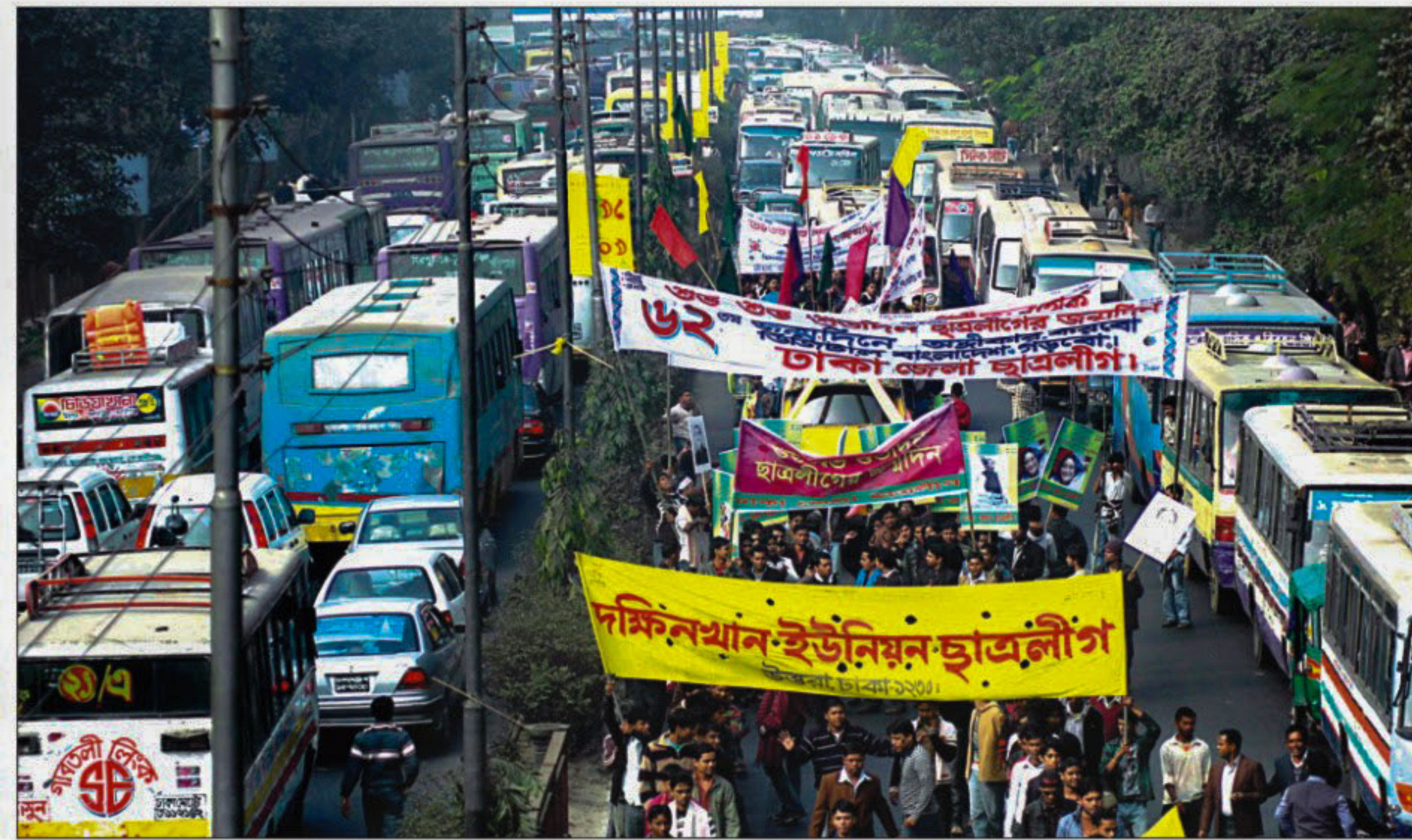
Bangladesh Chhatra League brings out massive processions to celebrate its 62nd founding anniversary causing huge gridlocks in the capital yesterday. The photo was taken near Institute of Engineers, Bangladesh around 1:30pm.