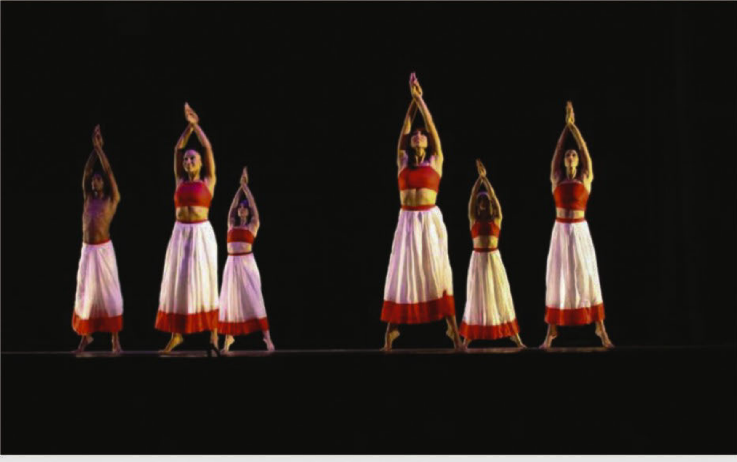
The performances by Dakshina fuses western and eastern elements.