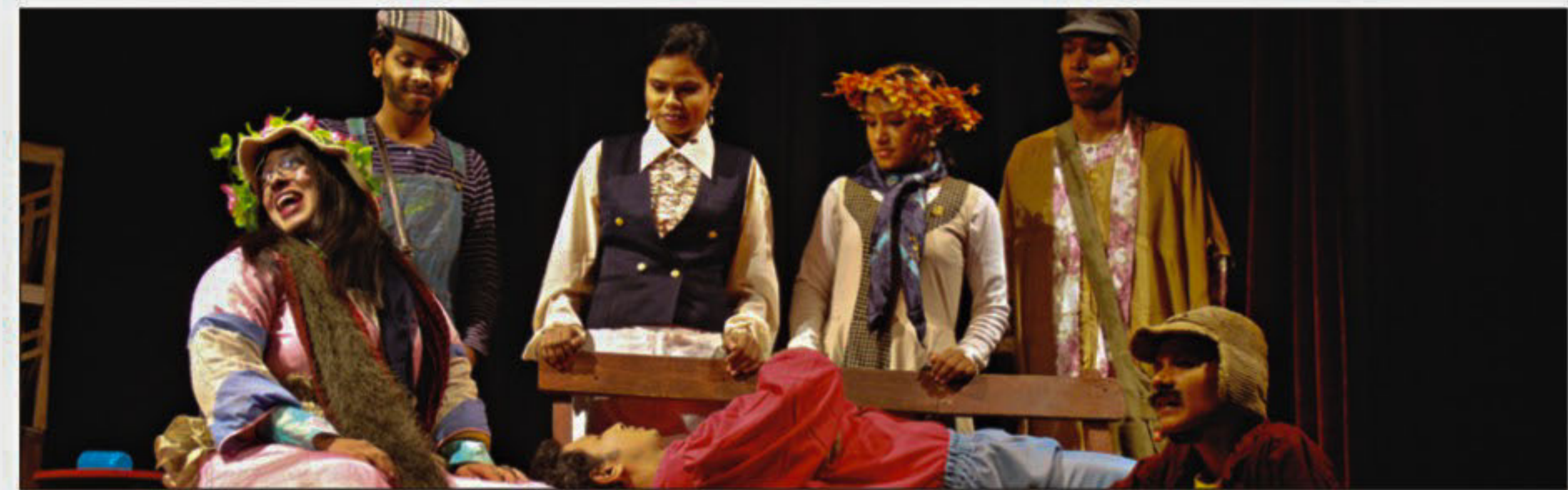
A scene from "Chailor Unmadini".

A round-table conference featuring eminent people from the world of theatre and allied arts will be held to discuss issues of current interest to theatre practitioners.