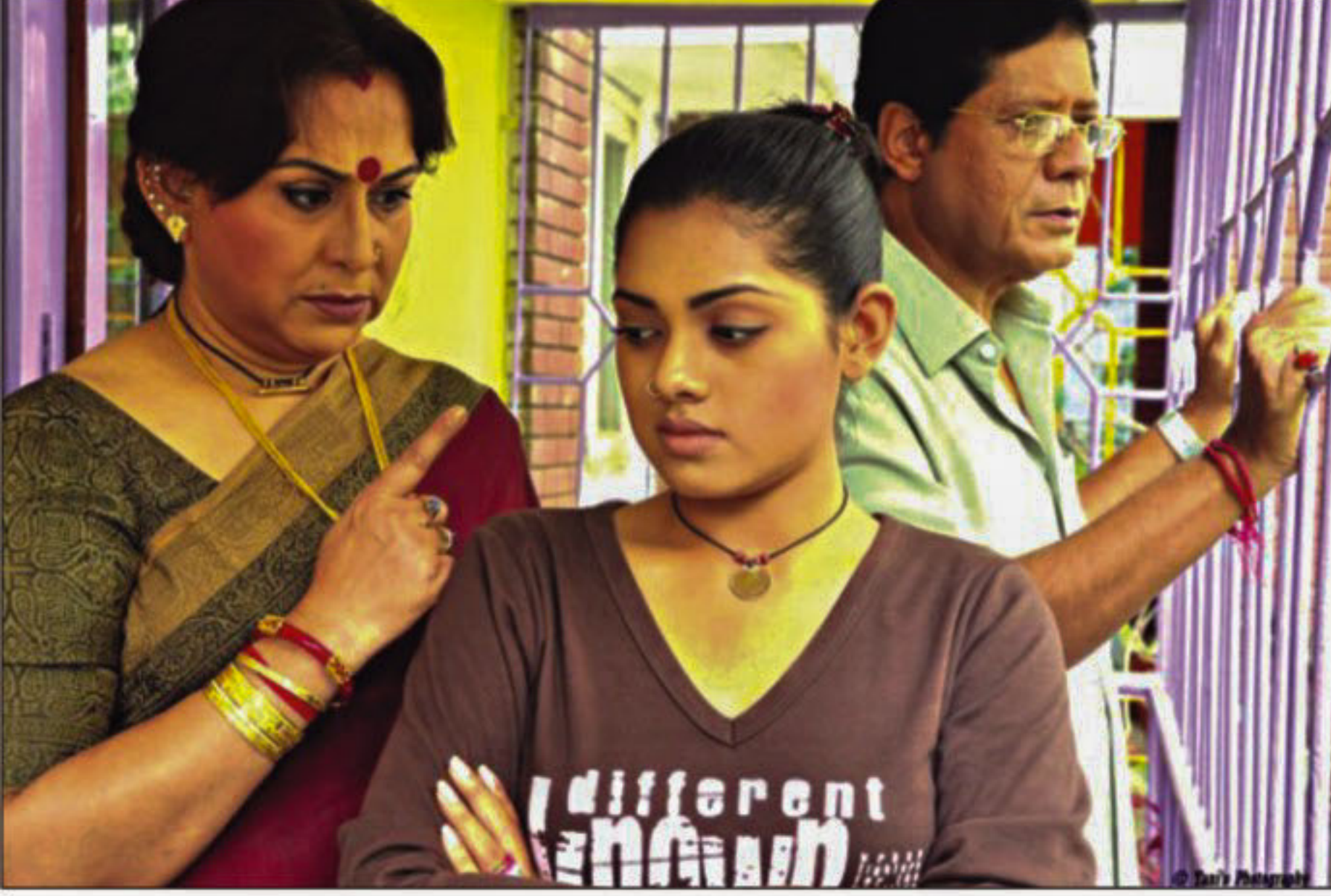
"Garbhodharini" narrates the adventures of four friends who want to change their surroundings.