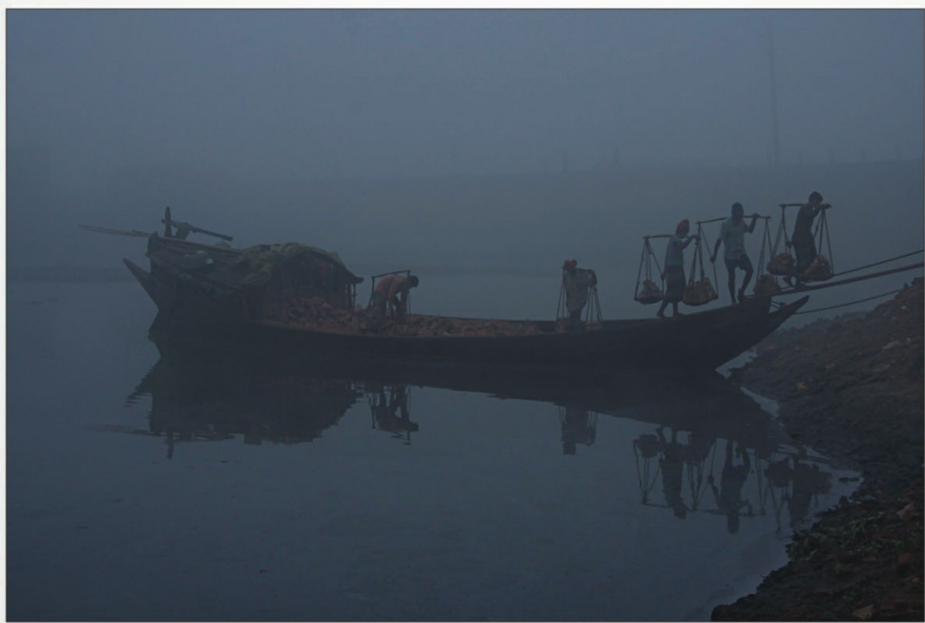
A cold wave has been sweeping through various parts of the country for the last few days. But the labourers at Mohammadpur in the city toil for a living amid morning chill yesterday.