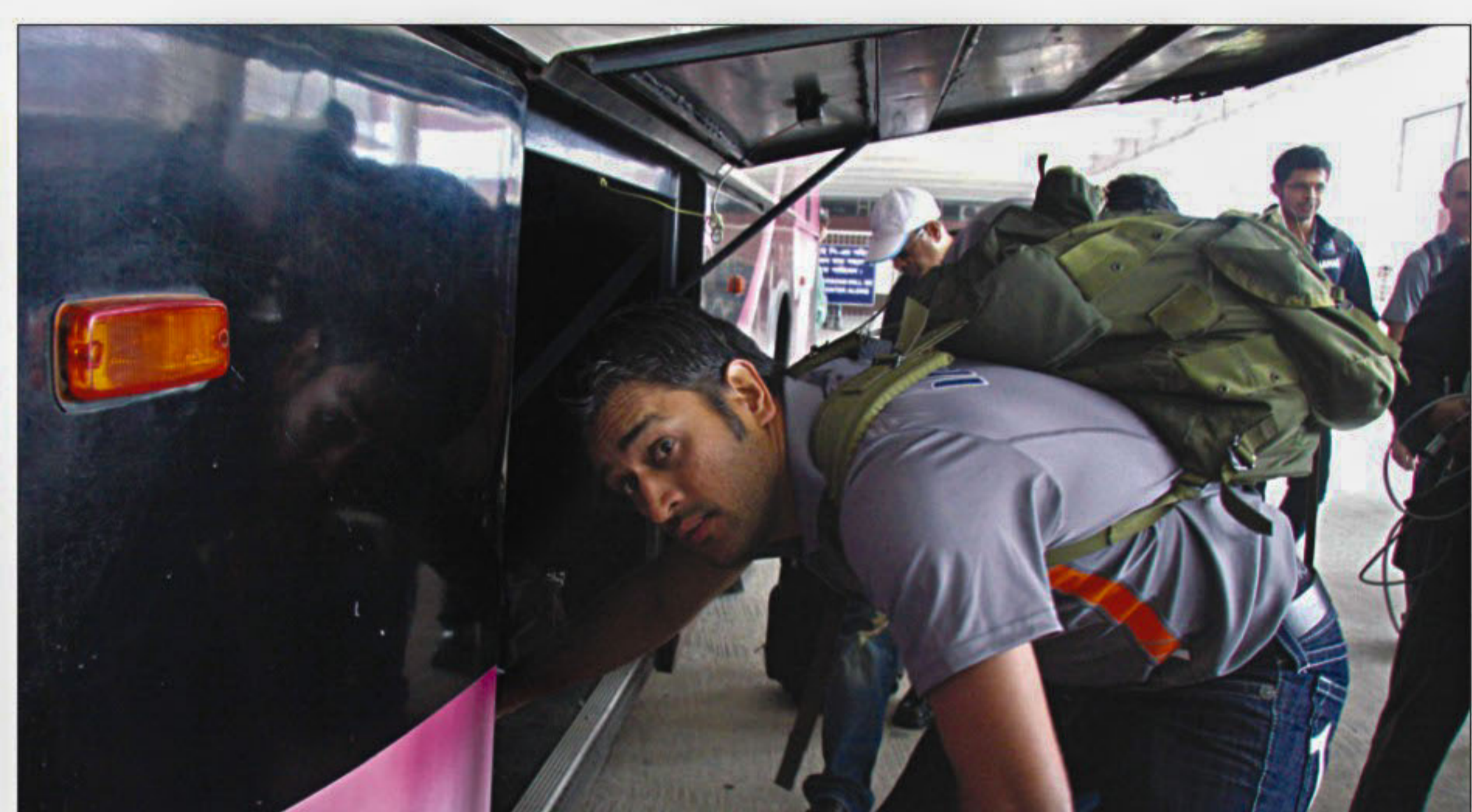
India captain Mahendra Singh Dhoni puts his luggage in the carrier of the team bus at the Zia International Airport yesterday. Team India arrived here yesterday afternoon to participate in the tri-nation cricket tournament, which runs through January 4-13, involving Sri Lanka and the hosts. Dhoni's men will stay back to play two test matches against the Tigers.