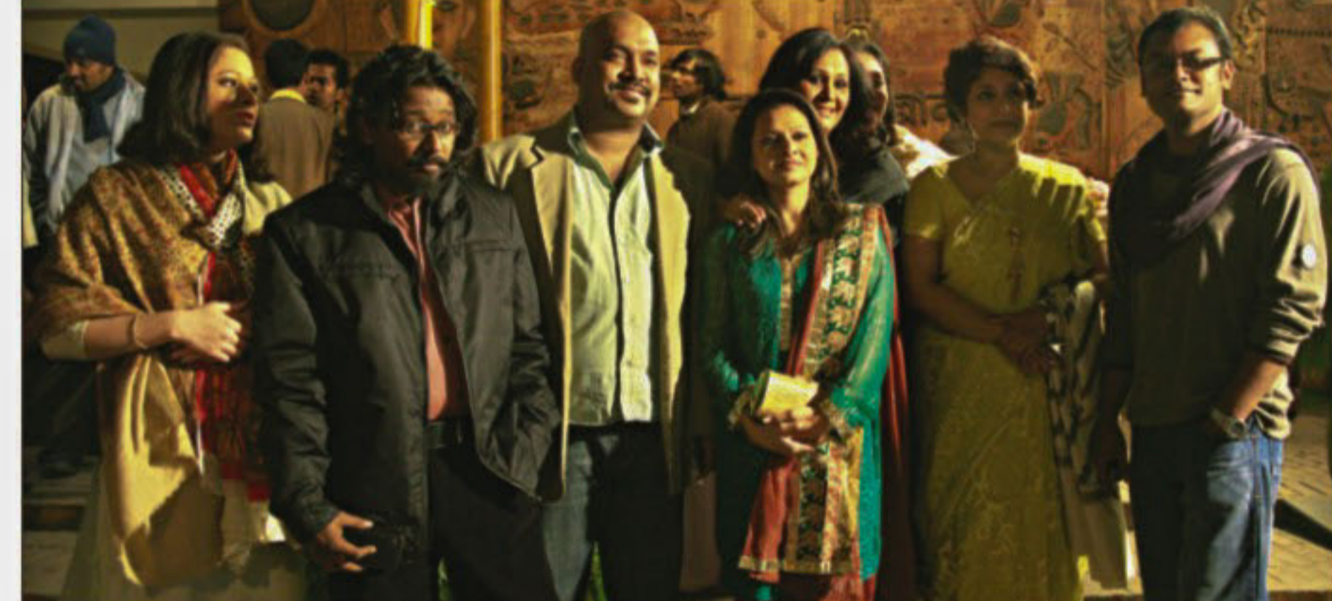
Professionals turned out in large numbers for the get-together.

In the function, the issue of the fashion magazine Canvas, a sister concern of Persona, was given out.