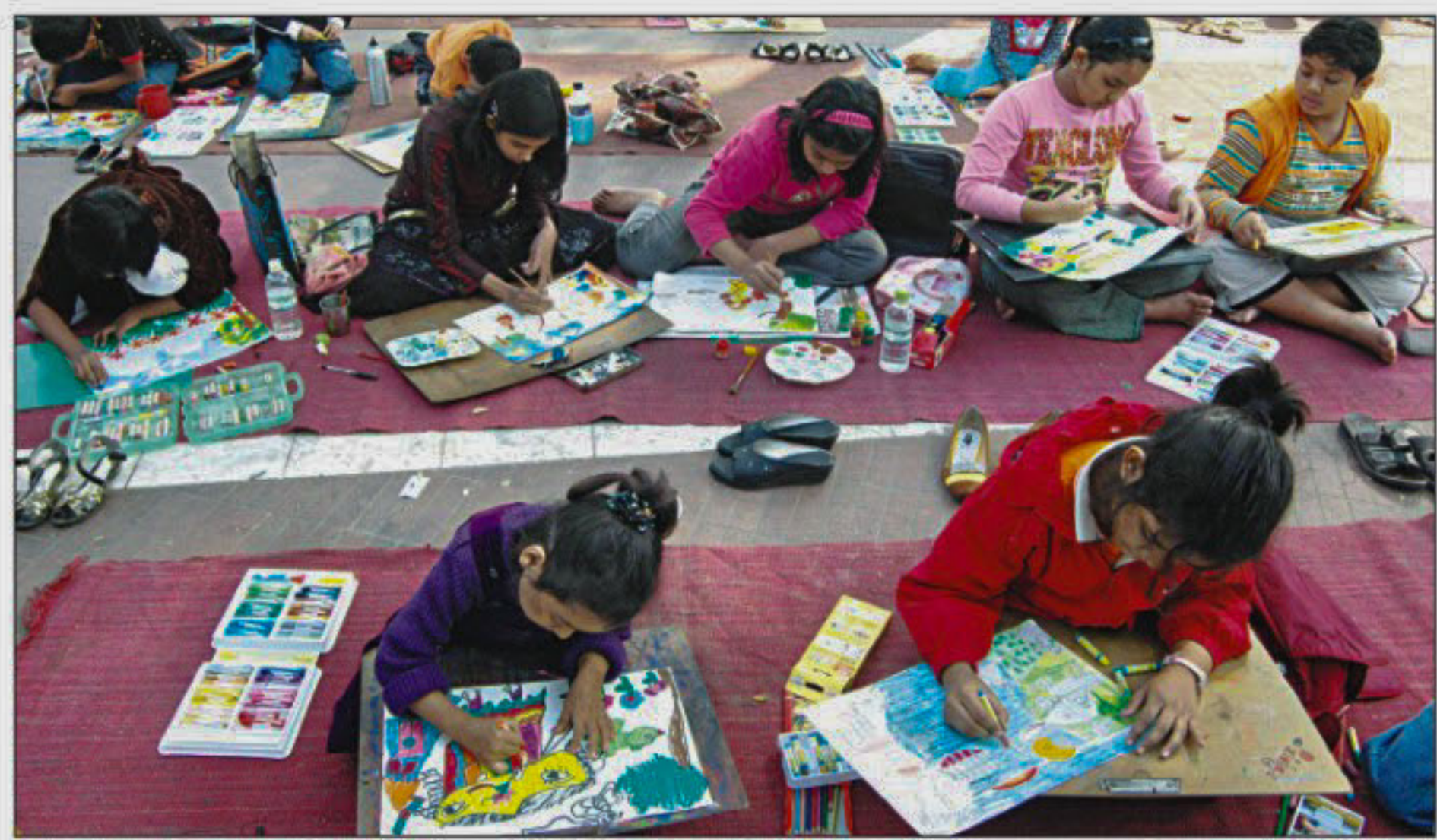
Children are engrossed in painting pictures at a competition at the Central Shaheed Minar in the city yesterday. Bangladesh Paribesh Andolon and Environment Network organised the event on the occasion of the 3rd International Conference on Bangladesh Environment.