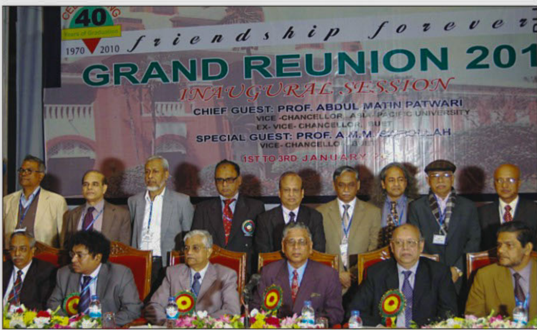
Graduates of 1970 batch of Buet, who are freedom fighters, pose for photograph with the guests at a grand reunion organised by the Buet '70 on the campus yesterday.