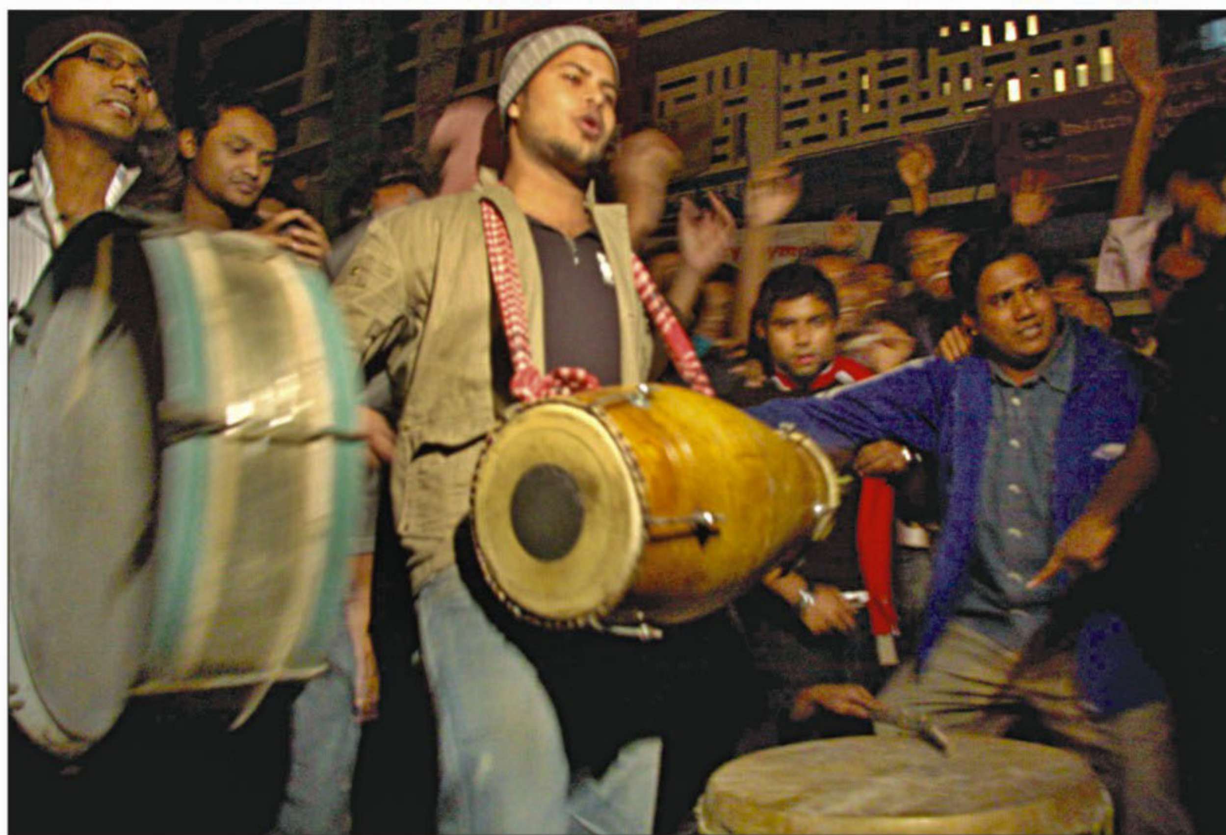
Students of Dhaka University welcome New Year-2010 amid much fanfare on the campus on Thursday night.

The report was prepared under the Multi-sectoral Programme to Resist Violence against Women (2nd phase) jointly initiated by the governments of Denmark and Bangladesh.