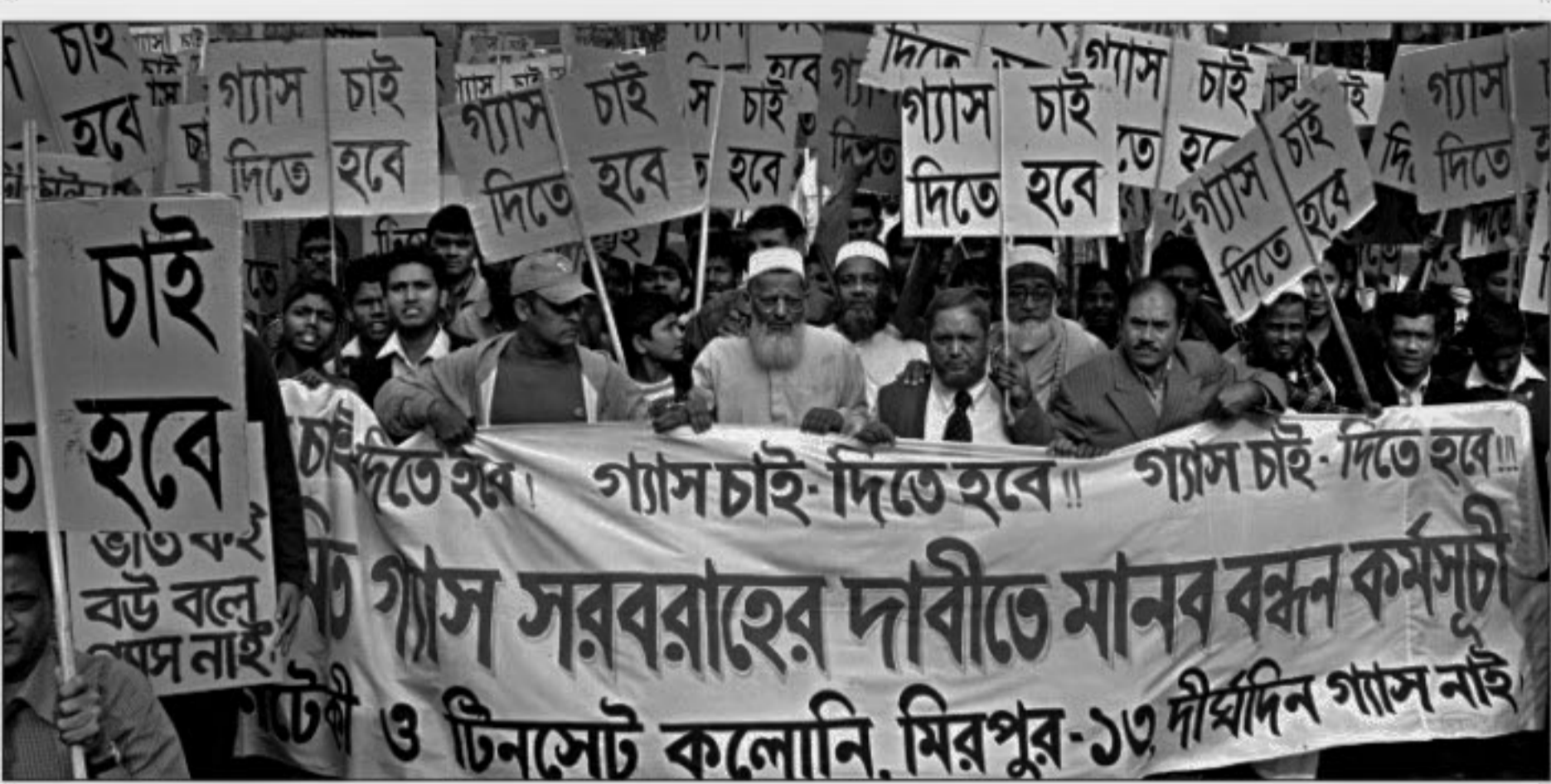
Hundreds of residents of Mirpur area stage a demonstration at Section-10 of Mirpur in the city yesterday demanding uninterrupted supply of gas in the area.

State Minister for Home Affairs Advocate Shamsul Haq Tuku, IGP Noor Mohammad and Police Academy Commandant Abdus Salam, PPM, were also present on the podium.