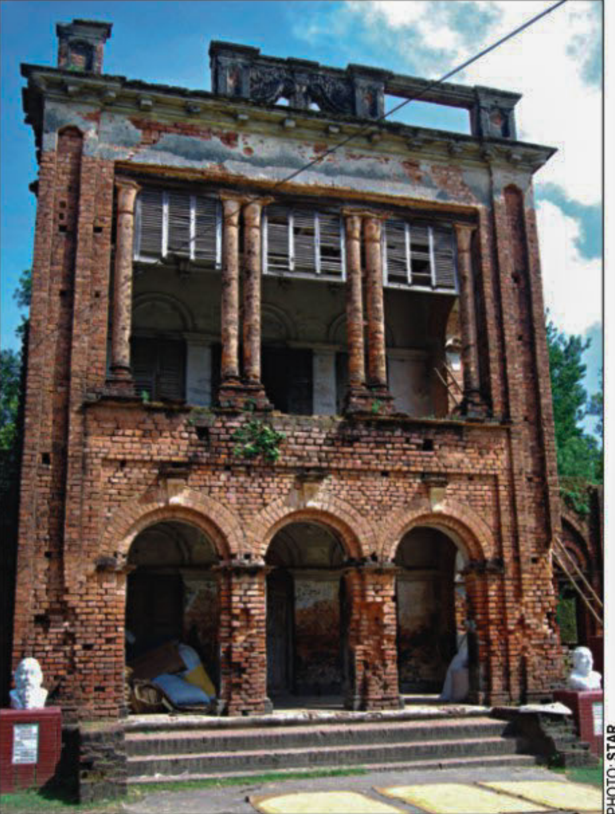
The facade of Tagore's father-in-law's residence at Dakkhindihi in Fultola upazila of Khulna district.