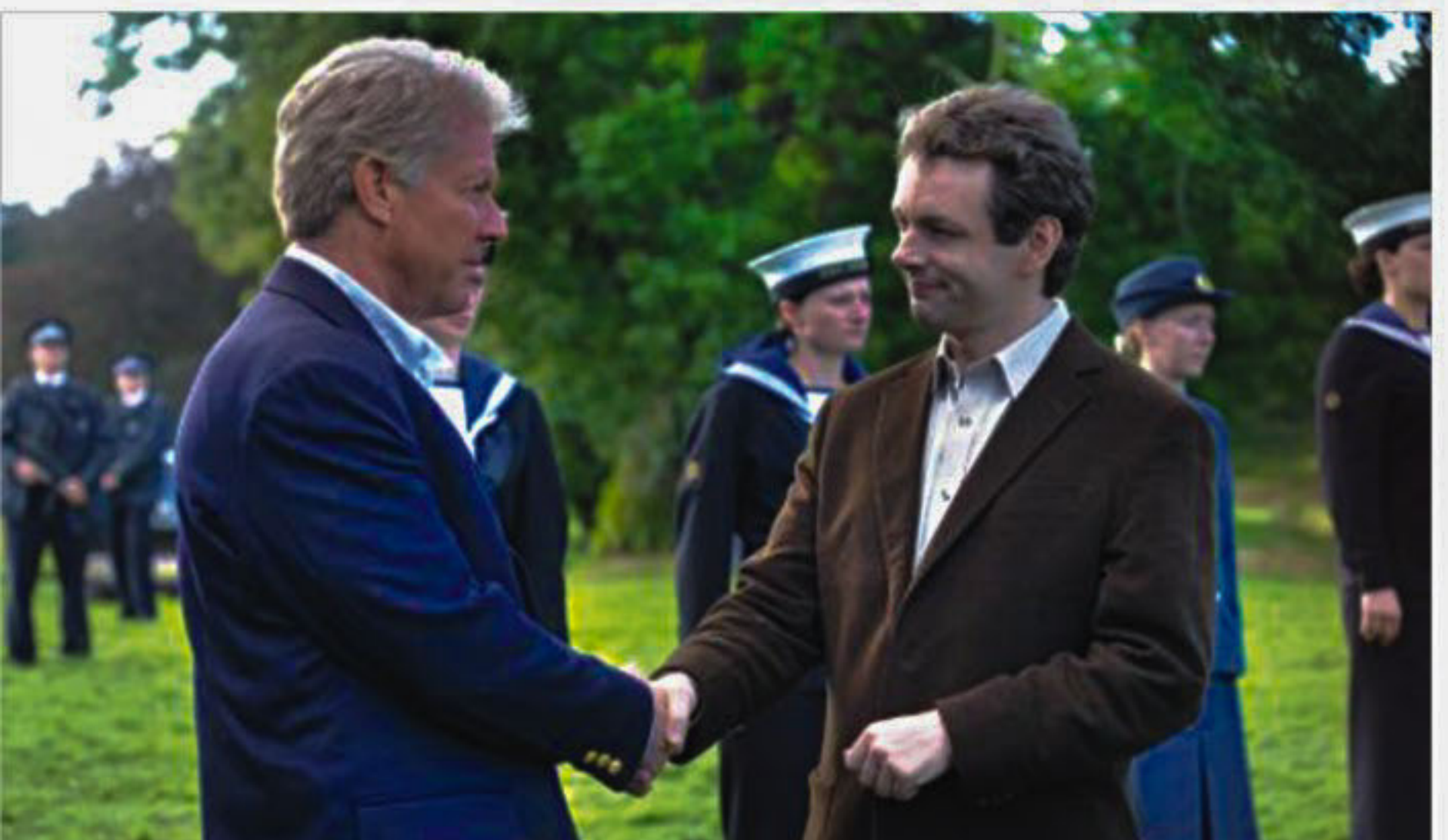
"The Special Relationship" looks at the bond formed between former US President Clinton (Dennis Quaid, left) and former British Prime Minister Tony Blair (Michael Sheen).