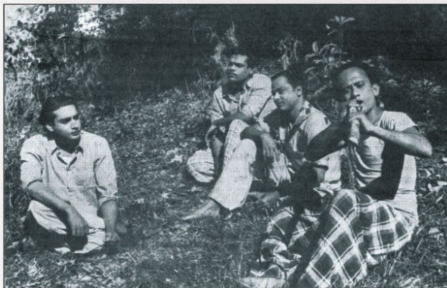
A scene from "Mukh O Mukhosh".