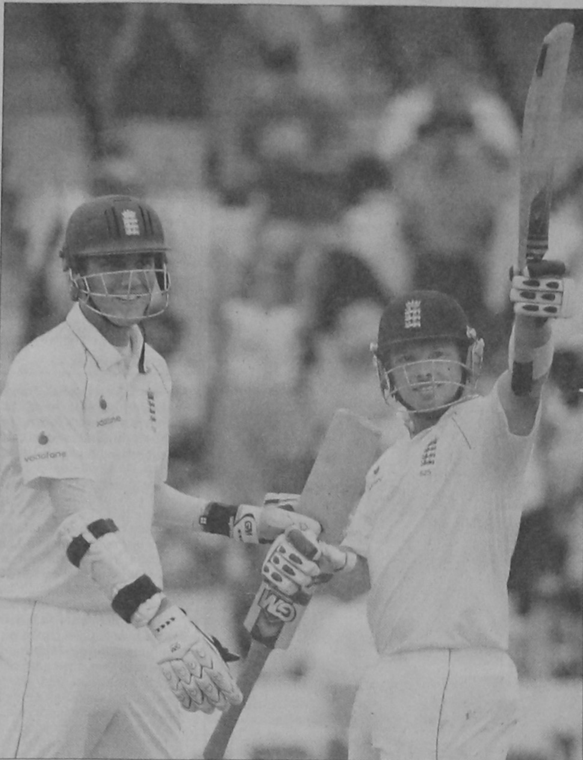
Stylish England batsman Ian Bell (R) raises his bat after scoring a century during the fourth day of the second Test against South Africa at Kingsmead in Durban yesterday.

Boxing legend Muhammad Ali was nicknamed 'The Greatest'. In 1999, he was crowned 'Sportsman of the Century' by Sports Illustrated and 'Sports Personality of the Century' by the BBC.