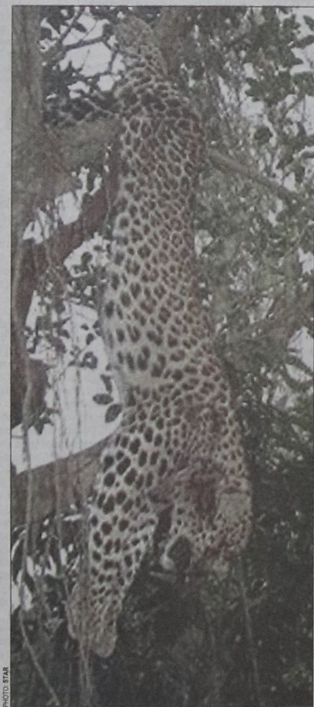
Villagers beat the leopard to death on Monday and hung it from a tree in Kishoreganj upazila of Nilphamari.