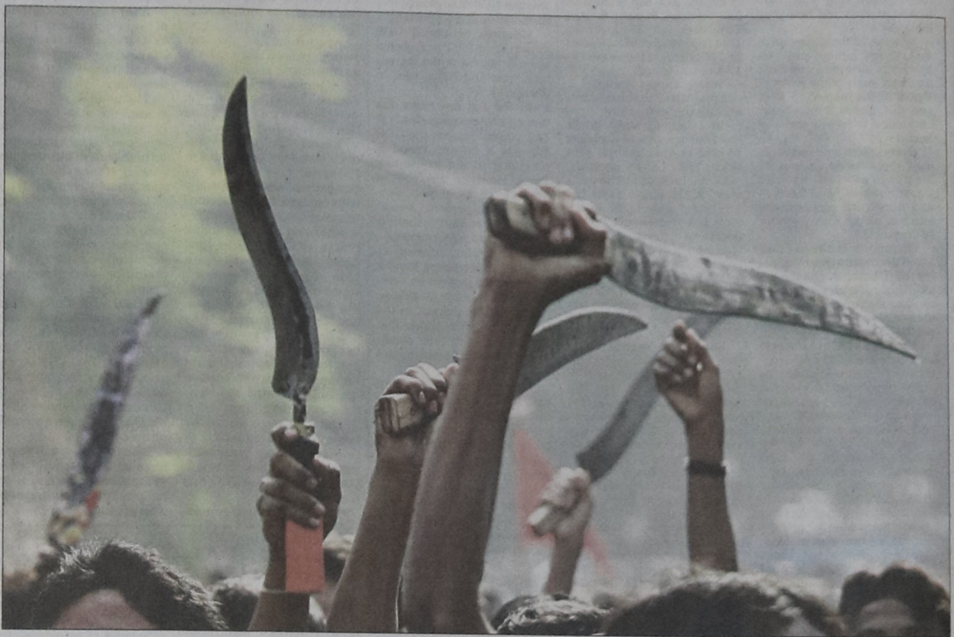
A group of miscreants take the opportunity of Ashura on Monday and bring out a procession armed with heavy sharp weapons. They vandalised several vehicles on Azimpur Road. Police had banned the use of such weapons during Ashura.