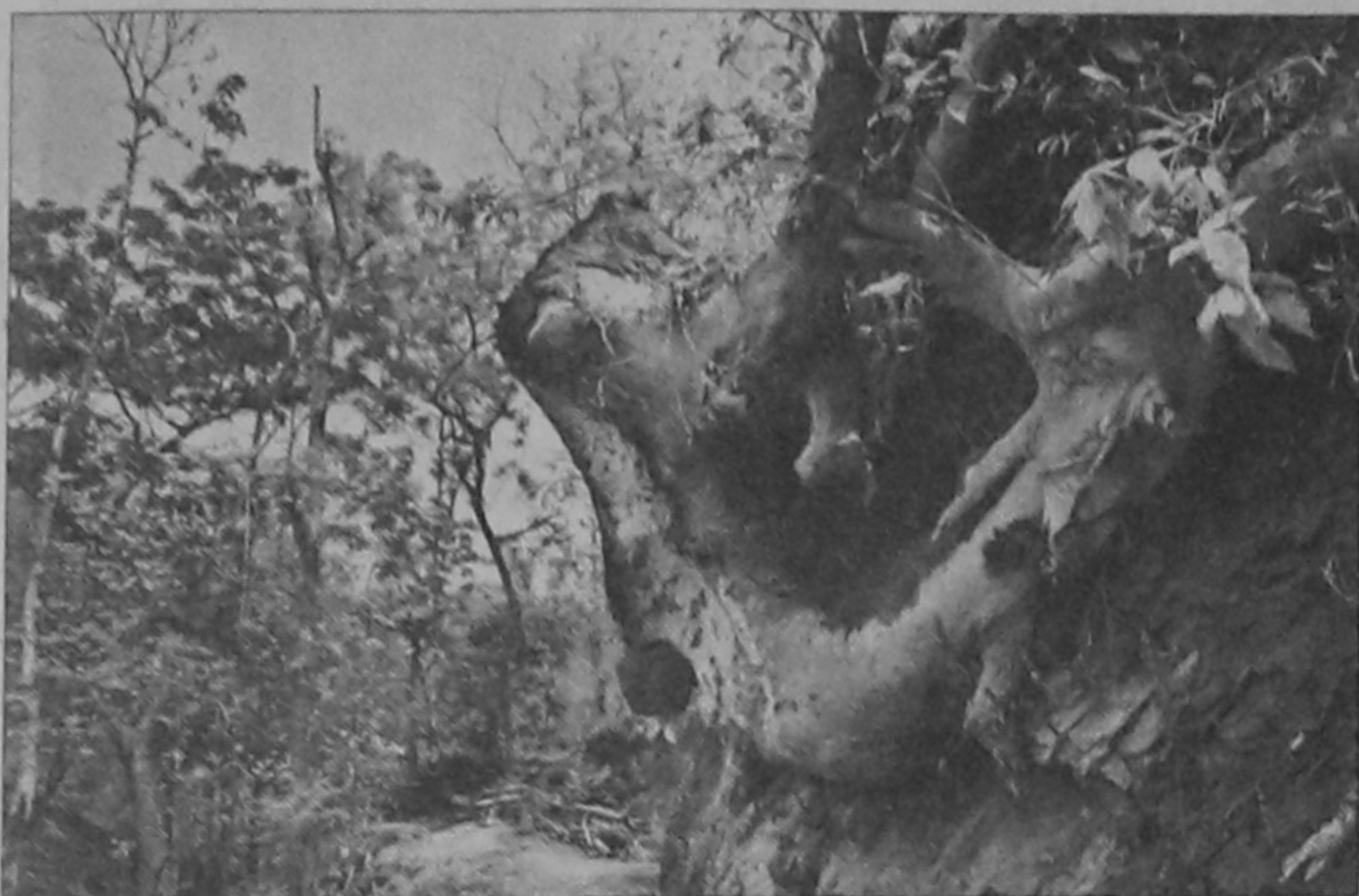
LITON RAHMAN / DRINKNEWS

The letter by Dr Reza Khan with the above title published in your newspaper (DS061209) draws attention to the dire need of Bangladesh. If the government takes responsibility for a quick decision. The political will is the major force to implement such a decision. Dr Reza Khan has been championing this idea of having a separate department for managing the wildlife and other remaining natural forests. If the government and the policy makers take a positive decision the future generation Bangladeshis would remember them with gratitude.