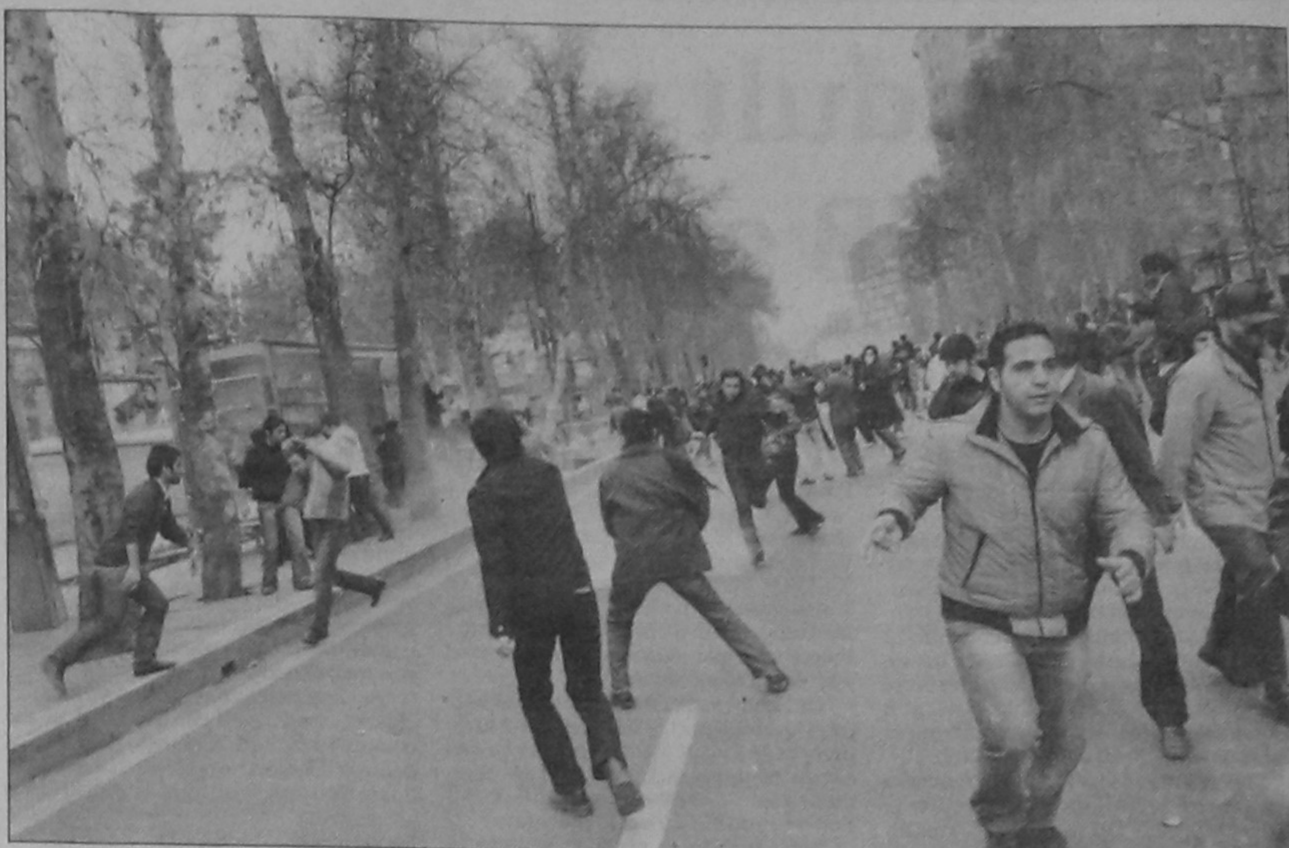
Iranian opposition protesters flee during clashes with security forces in Tehran yesterday. Four protesters were shot dead by security forces in central Tehran as thousands of opposition supporters staged anti-government protests during the Shia mourning event of Ashura, a website said.

His memorials have brought out not only the young, urban activists who filled the ranks of earlier protests, but also older, more religious Iranians who revered Montazeri on grounds of faith as much as politics. Tens of thousands marched in his funeral procession in the holy city of Qom on Monday, many chanting slogans against the government.