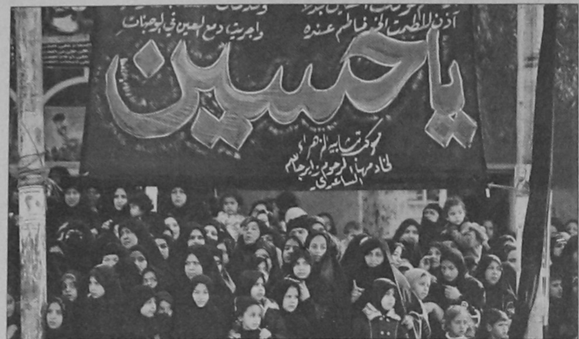
Standing under a banner that reads in Arabic, "Oh Hussein" Iraqi Shia Muslim women watch a play and procession marking the climax of the Ashura yesterday in the Sadr City neighbourhood of Baghdad. The 10-day Ashura rituals commemorate the killing of Imam Hussein (RA), a grandson of Prophet Hazrat Mohammed (SM), by armies of the caliph Yazid in 680, in the southern Iraqi city of Karbala.

Some felt that it was probably a government strategy, to allow the six Ulfa leaders to meet inside the jail.