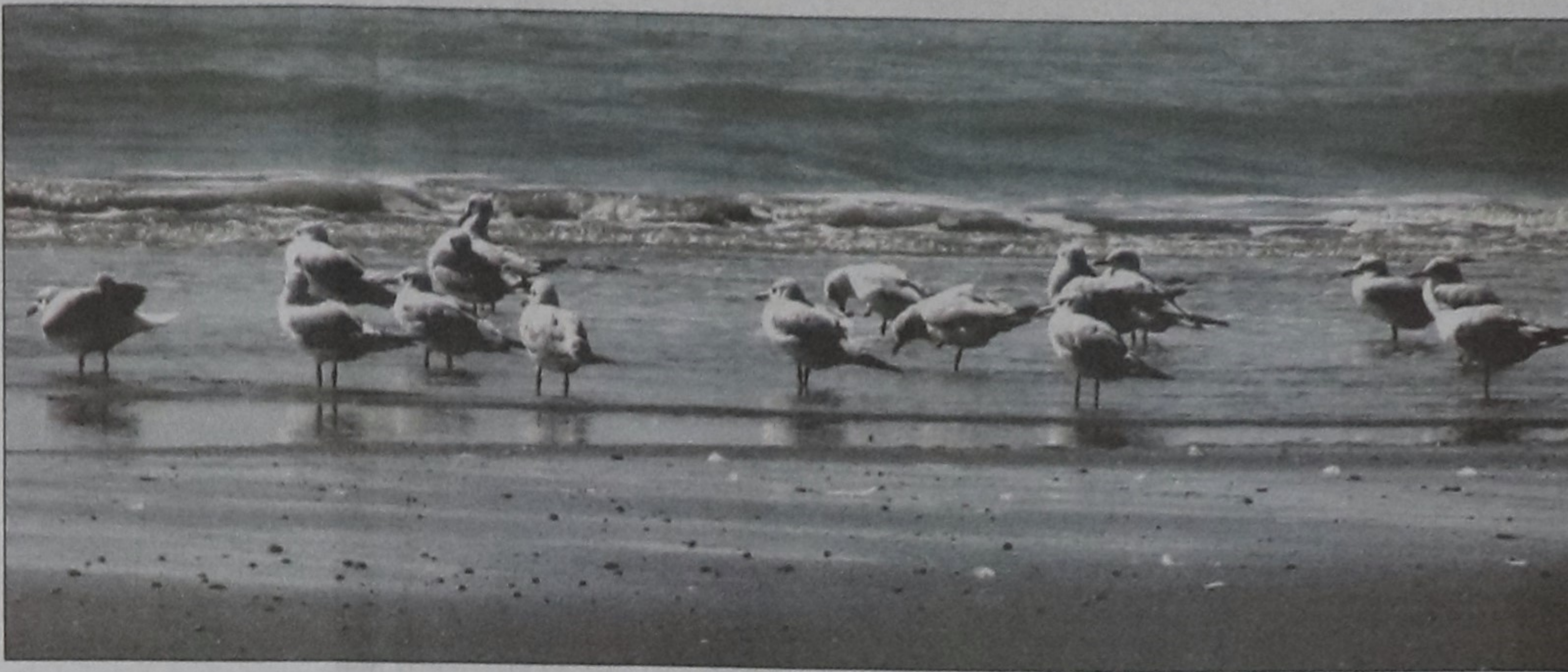
A flock of migratory birds has found a safe haven at Bodormokam in Teknaf adding to beauty of the coastal area this winter.