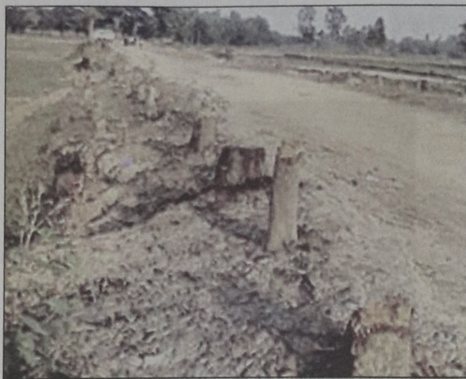
Trunks of trees felled by criminals lie on both sides of Harinshing-Kanchan Bazar road in Pirganj upazila of Rangpur district, right, the gang taking away the trees in a truck in broad daylight.