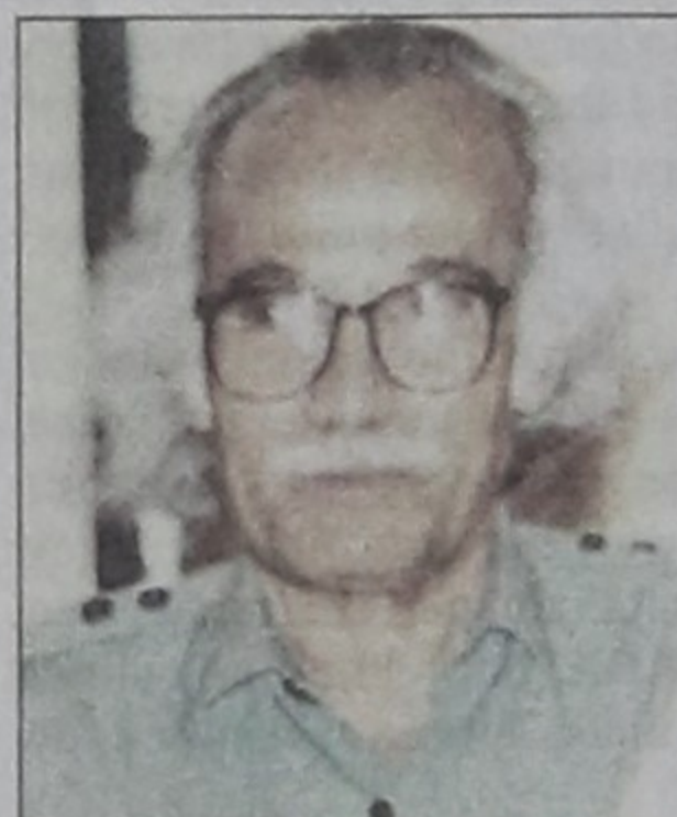
Prof Muhammad Yunus

teachers of the department brought out a silent procession on the campus at around 11:00am and held a rally in front of the department.