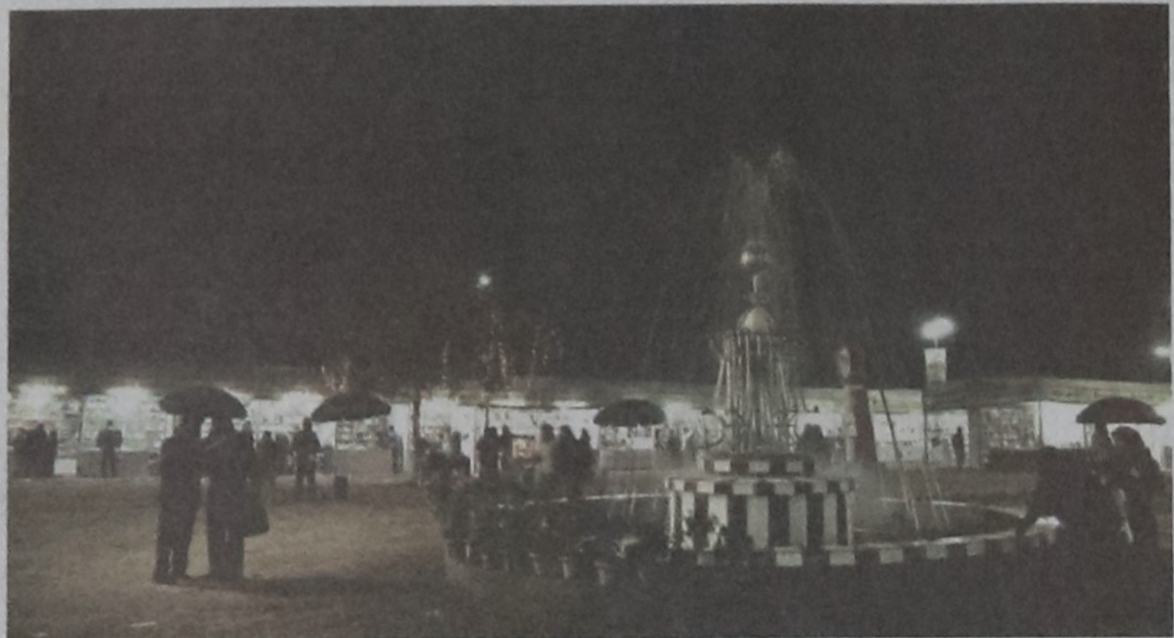
The book fair featured 169 stalls, including two publication houses from overseas.