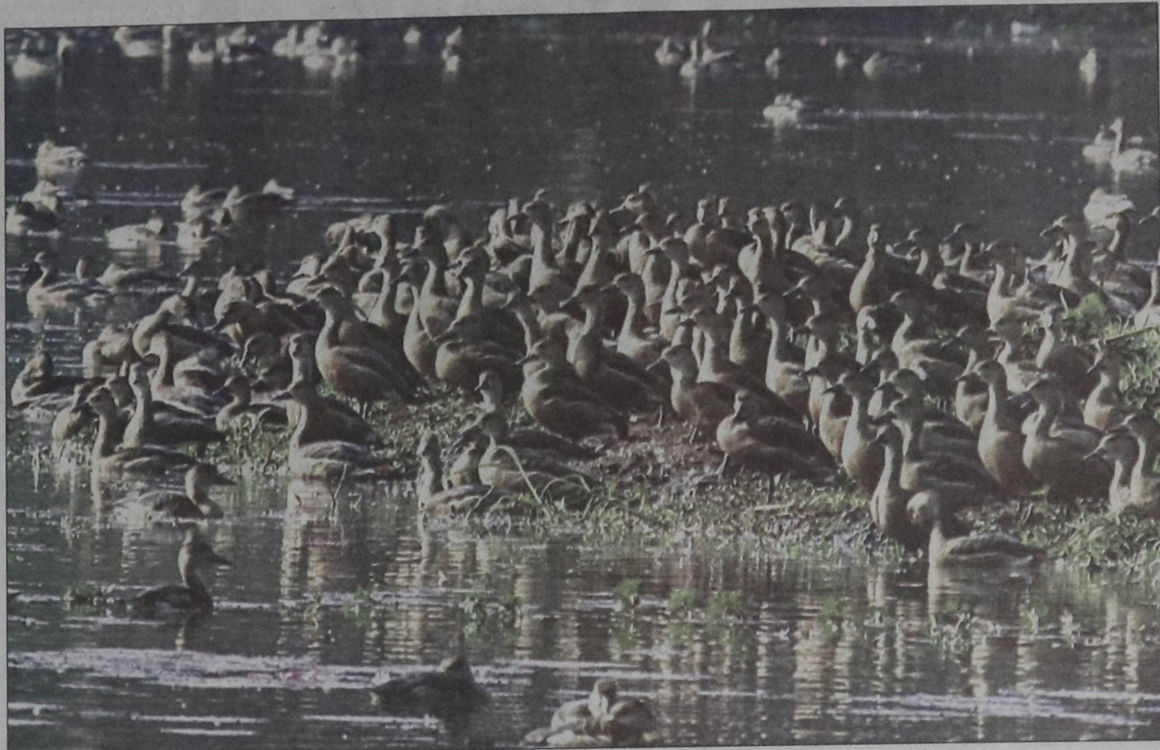
With the arrival of winter, thousands of migratory birds, mostly lesser whistling ducks, have taken shelter at the Jahangirnagar University sanctuaries. Despite less in number this year, their chirps attract the birdwatchers as always.