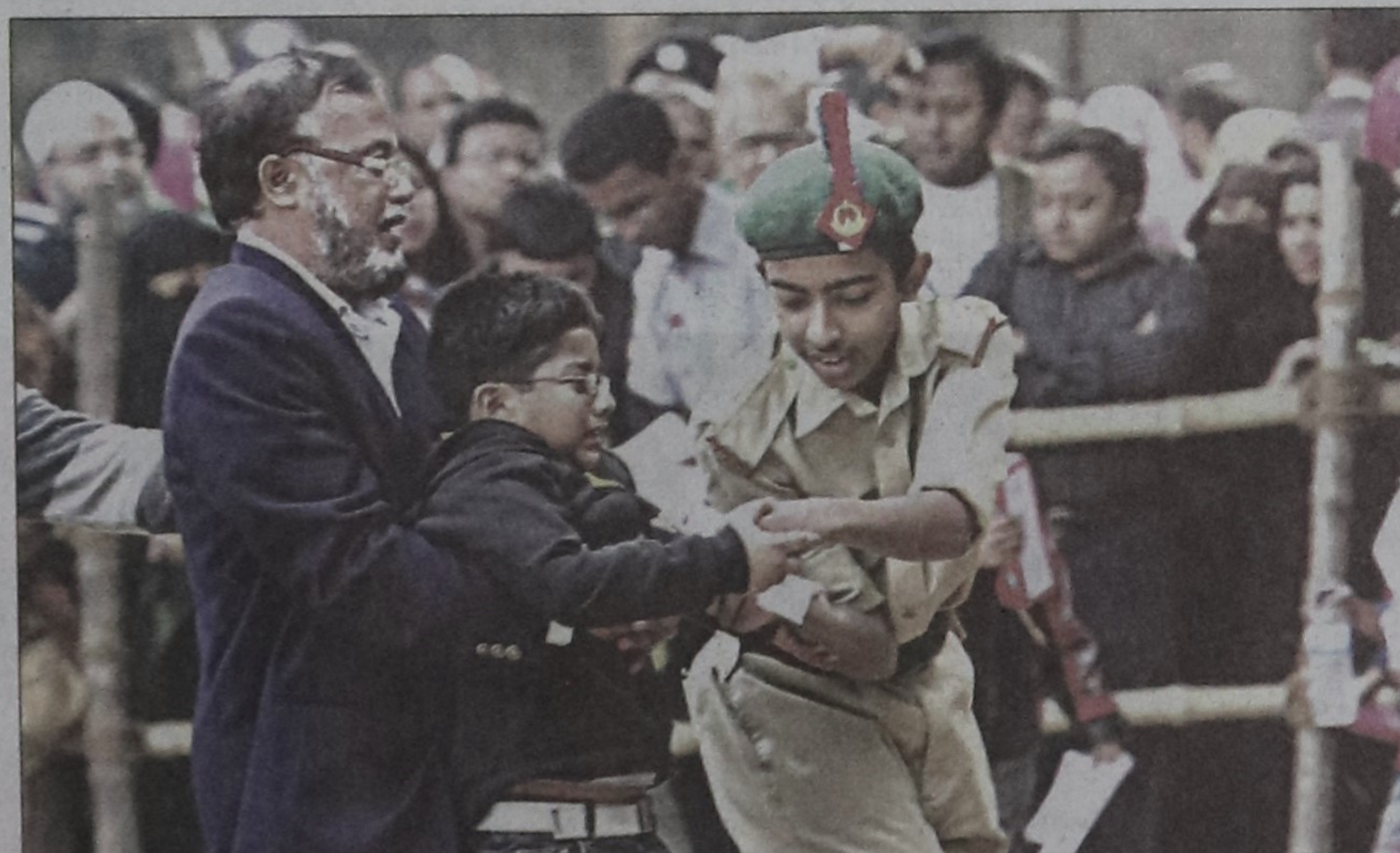
A teacher with the help of a scout is trying to take a child to the exam hall of class I admission test at the Government Laboratory High School in Dhaka yesterday, but the little boy is adamant not to move a single step.