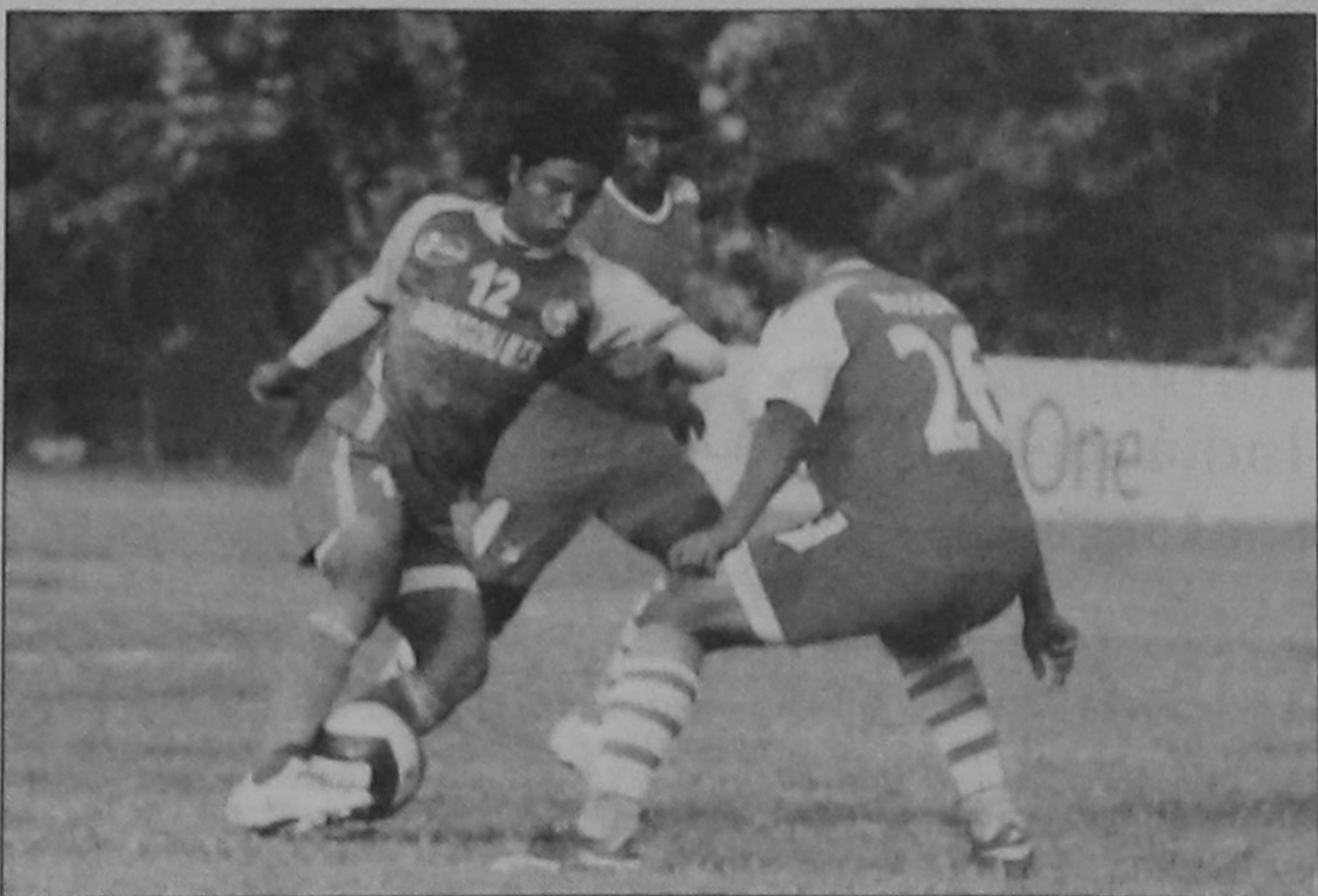
Action from yesterday's Bangladesh League match between Rahmatganj and Brothers Union at the Birshreshtha Shaheed Mostafa Kamal Stadium in Kamalapur.