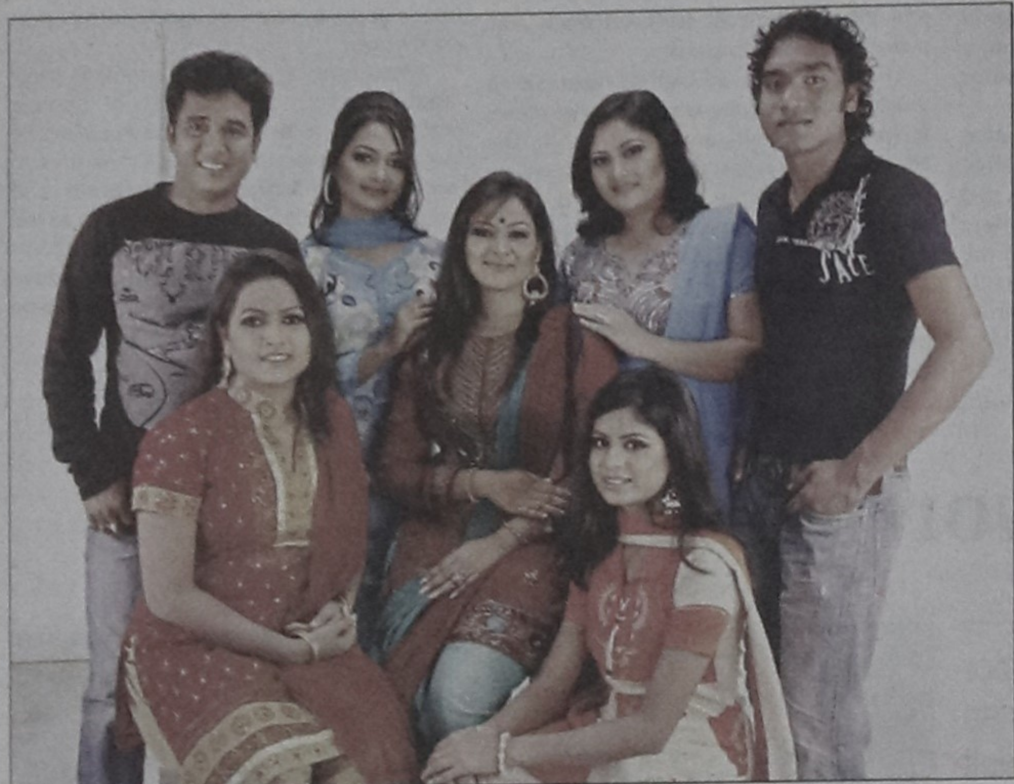
The "Channel i Shera Kantho '09" finalists.